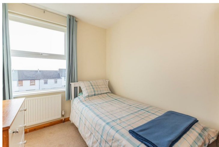
Bedroom 3 9' x 6'11"

To the front of the house there is a small single bedroom, which could also be used as an office space or walk-in wardrobe.