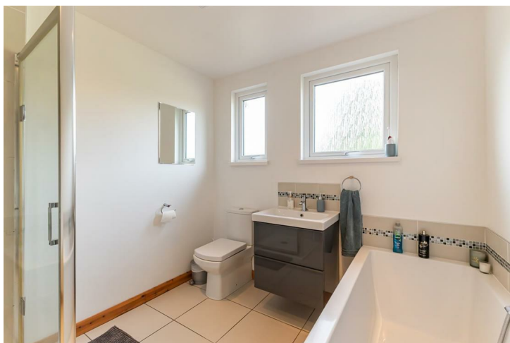
Bathroom 8'05" x 8"

This modern bathroom offers a contemporary design with a neutral colour scheme. It features a shower and a bath which are complemented with a stylish mosaic tile detailing along the wall.