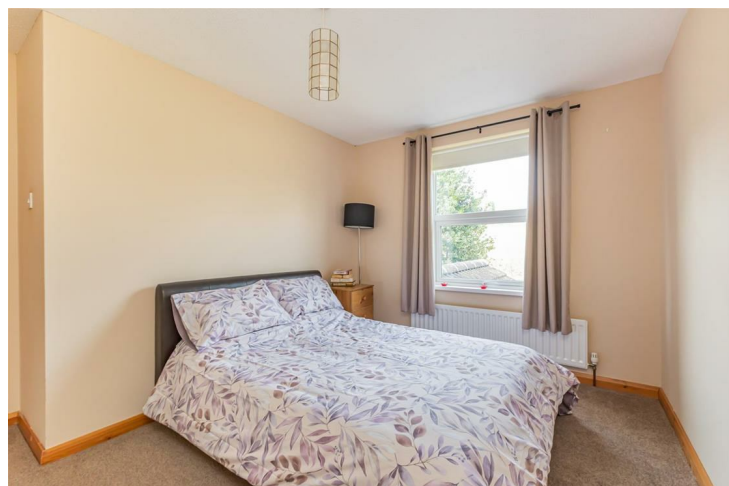
Bedroom 2 11'11" x 9"

A double bedroom to the rear of the house, again with some built in storage keeping the space uncluttered and maximizing floor space. The large window allows plenty of natural light to fill the room, creating a warm and inviting atmosphere.