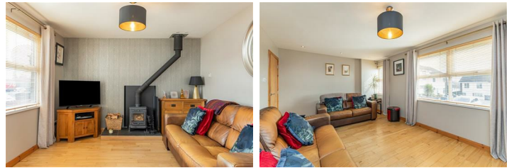
Living Room 17'06" x 11'04"

This living room is bright and spacious, featuring two windows, allowing for plenty of natural light. The light wood flooring enhances the sense of space and adds warmth to the room.