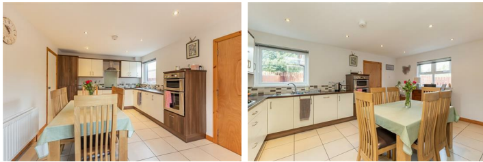
Kitchen/Dining Area 17'06 x 11'04"

The kitchen area is bright and spacious, featuring a modern open-plan layout. It includes a combination of white and wood-finish cabinetry, offering ample storage space with high and low units. The countertops are sleek and practical, complemented by a stylish tiled backsplash.