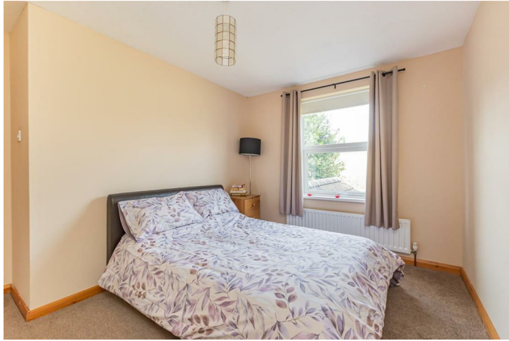
Bedroom 2 11'11" x 9"

A double bedroom to the rear of the house, again with some built in storage keeping the space uncluttered and maximizing floor space. The large window allows plenty of natural light to fill the room, creating a warm and inviting atmosphere.