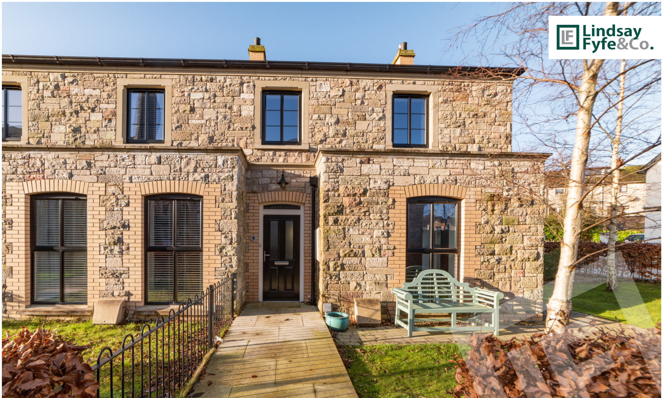
9 Mill Court, The Mill Village, Comber, BT23 5PB Delightful Modern End Townhouse In the Highly Regarded Mill Village - £265,000