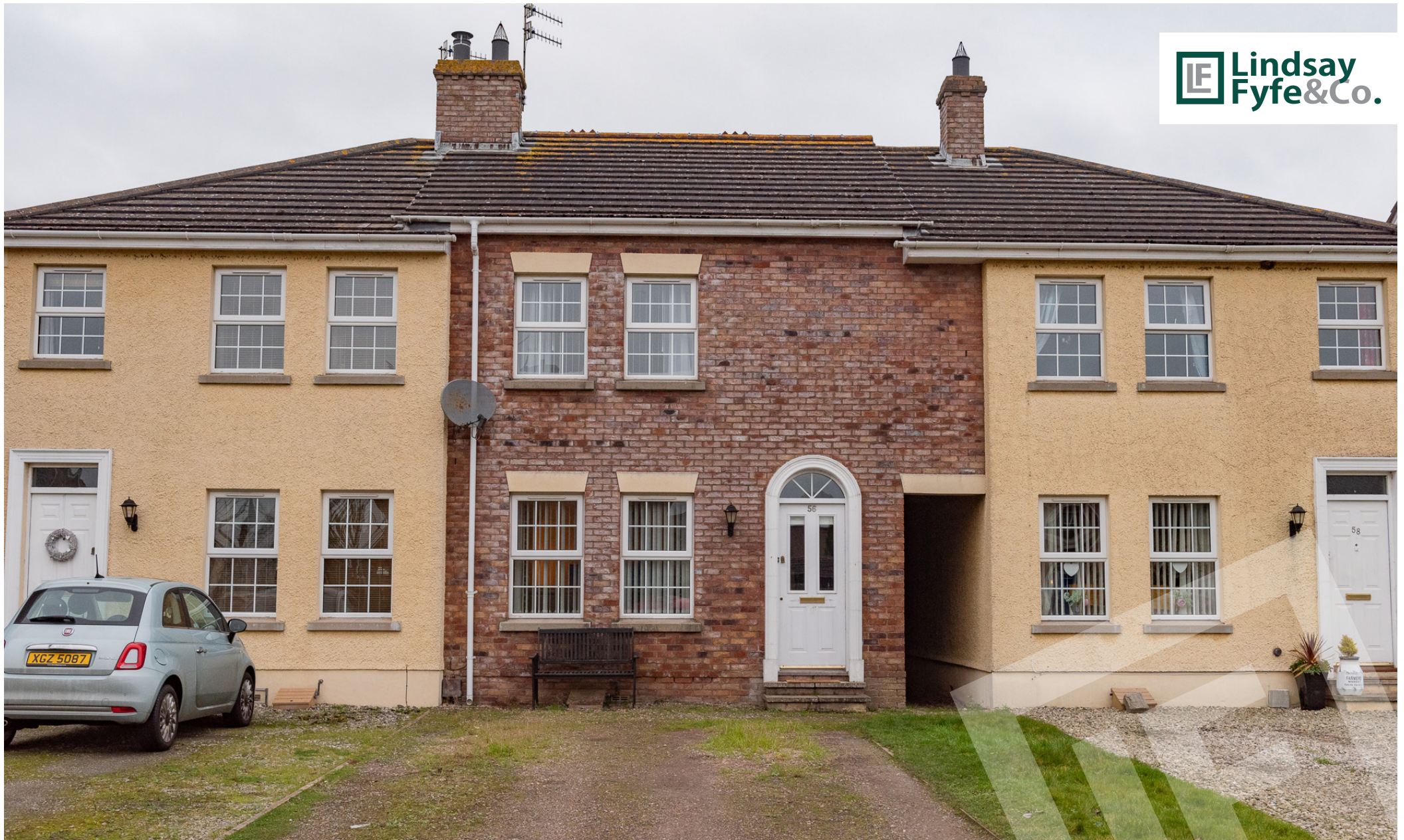
56 Ravenhill Lane, Newtownards, BT23 4PH Modern Townhouse In a Small Convenient Development - £144,950