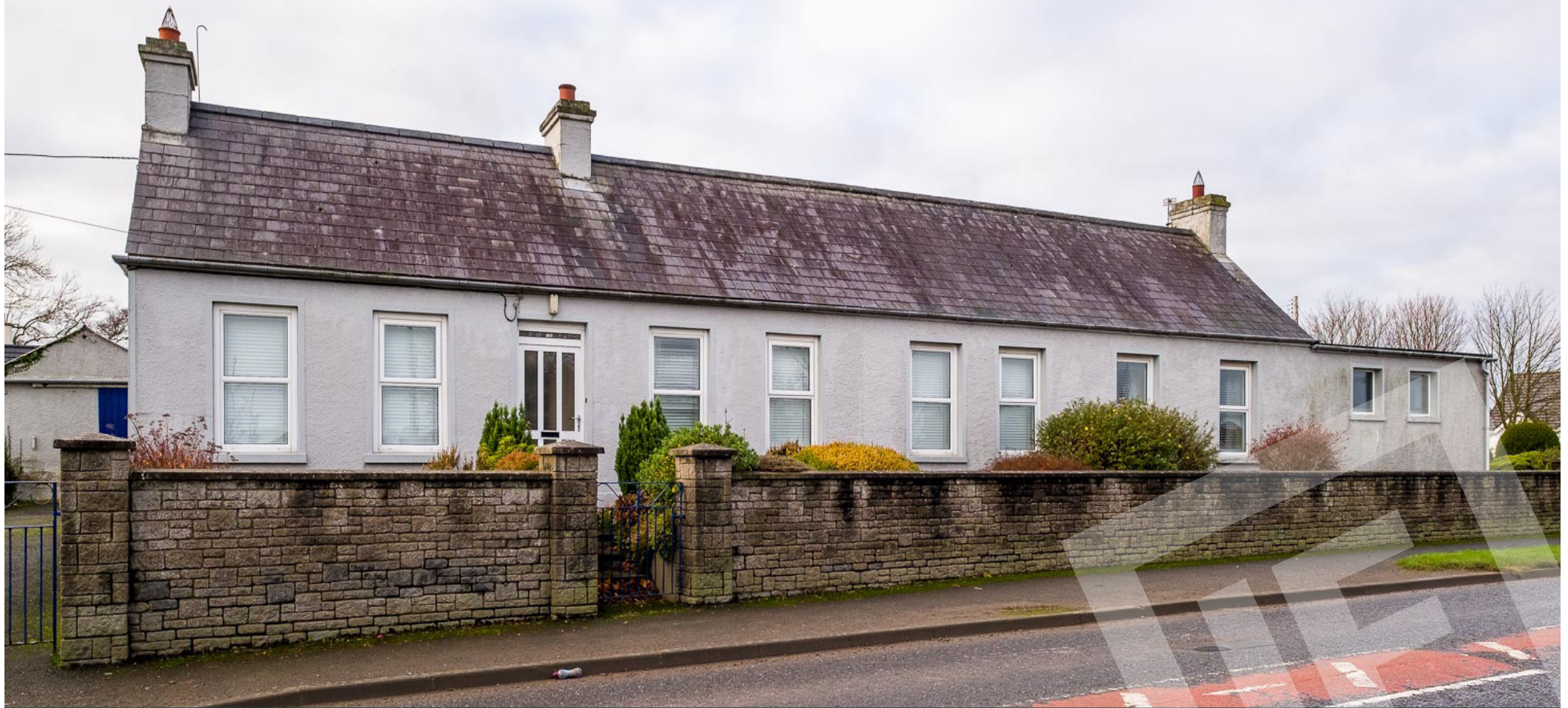
189 Killinchy Road, Lisbane, Comber, BT23 6AA Detached Cottage Of Character On A Spacious Site - £285,000