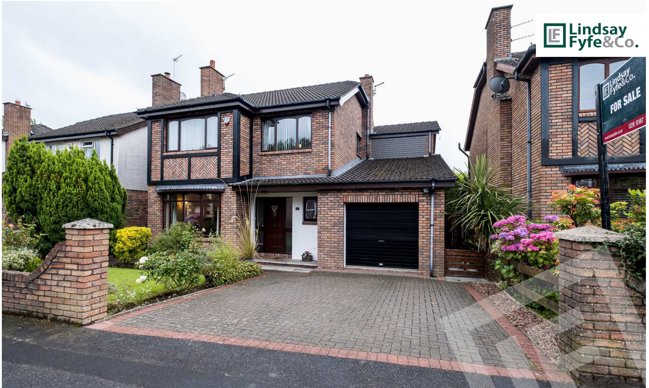
3 Rosepark Meadows, Belfast, BT5 7TL Spacious Family Home in a Quiet Cul-De-Sac Position - £329,950