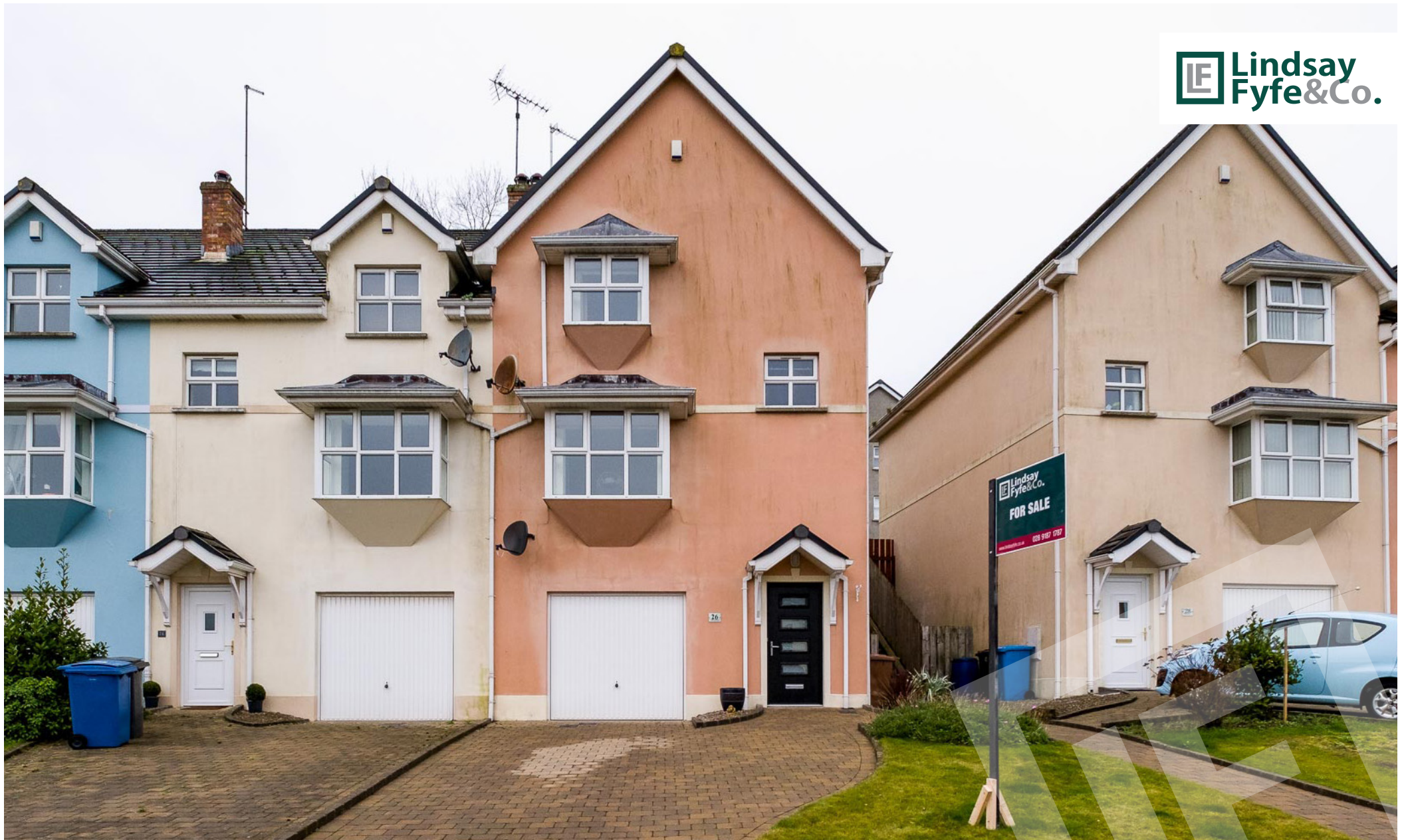
26 Todds Hill Park, Saintfield, BT24 7FB Spacious Townhouse in a Small Exclusive Development - £169,950