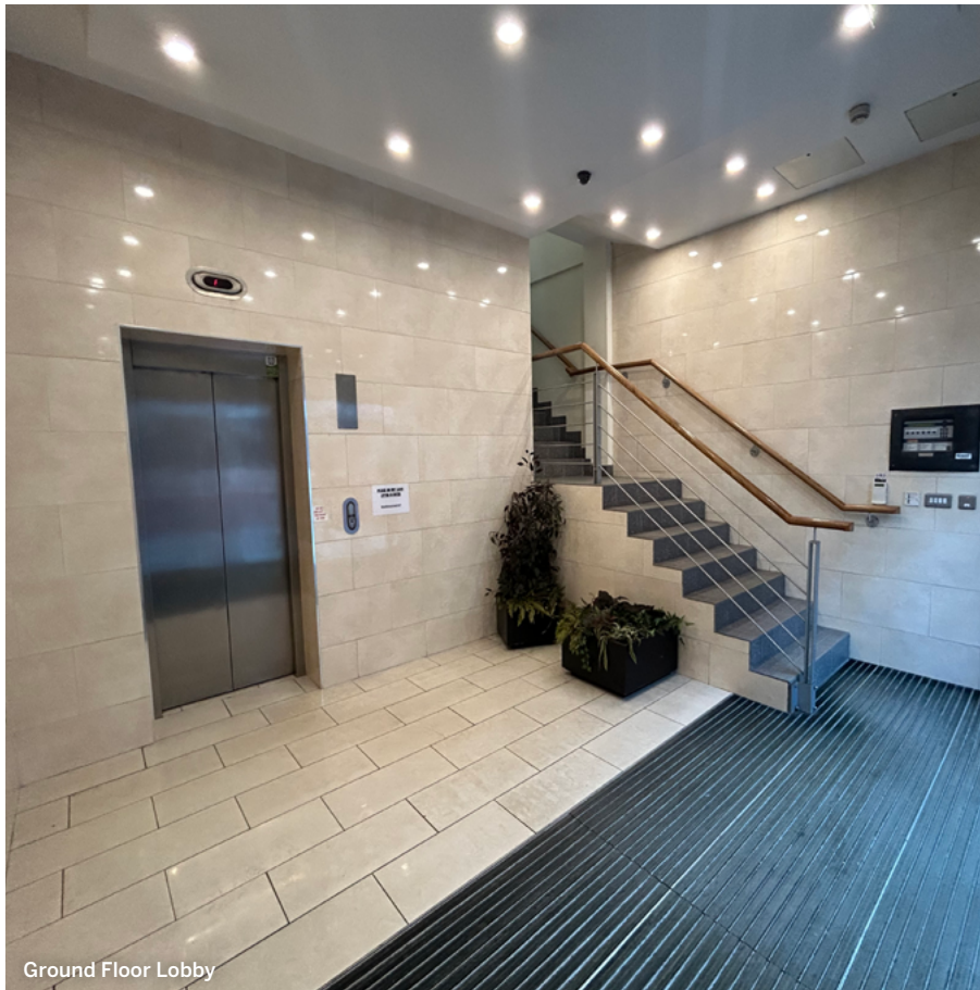
Ground Floor Lobby