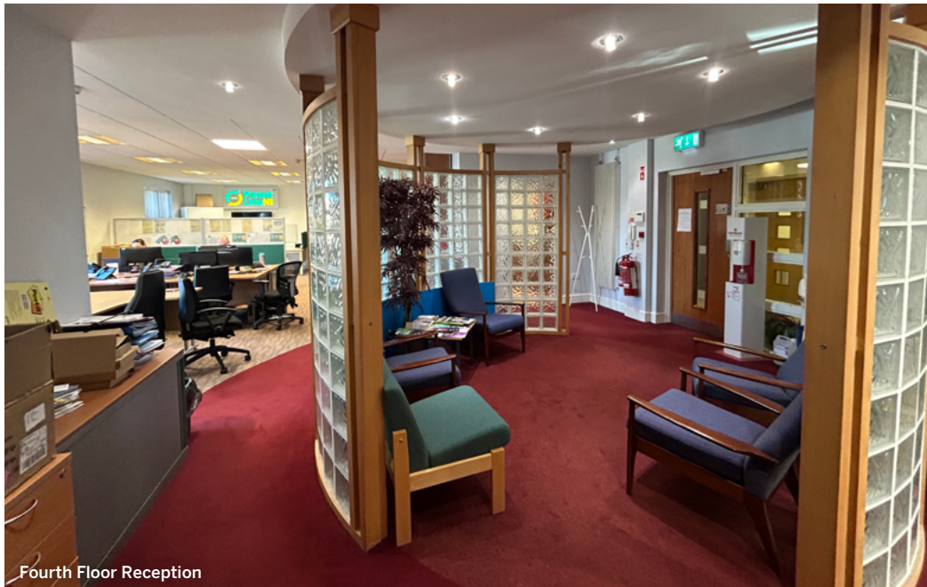
Fourth Floor Reception