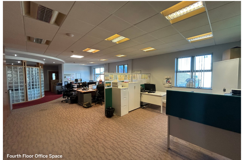
Fourth Floor Office Space