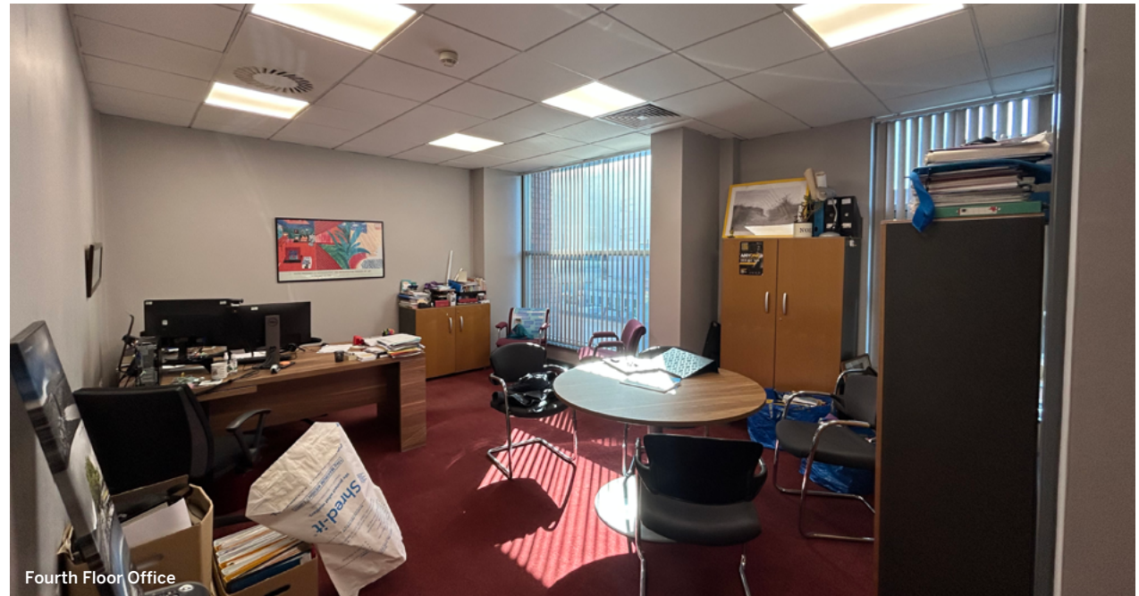
Fourth Floor Office

NAV: £33,388 Rates Poundage 2025/26: £0.626592 Approximate Rates Payable: £20,921 per annum