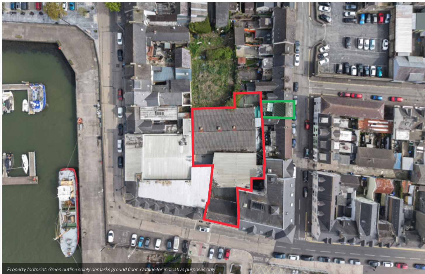
Property footprint: Green outline solely demarks ground floor. Outline for indicative purposes only

The town is perfectly positioned just a stone's throw away from a vast array of tourism spots and visitor attractions, including the following; Mourne Mountains & Silent Valley, the Ring of Gullion, Slieve Gullion Forest Park and numerous popular golf courses, including Newry, Rostrevor, Kilkeel, Banbridge, Dundalk, Armagh and the famous Royal County Down Golf Club.