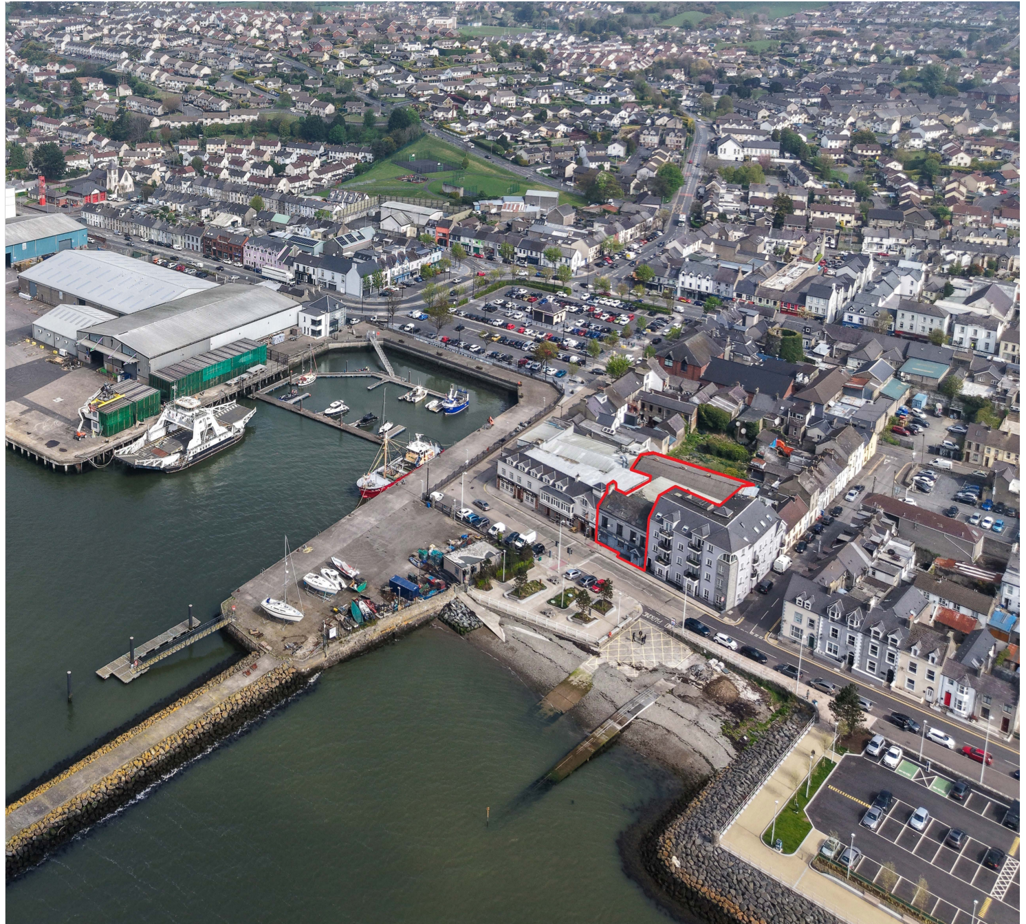
Property outline for indicative purposes only

Under NI Small Business Rate Relief, business properties with a NAV of more than £5,000 but not more than £15,000 should receive a 20% rate relief.