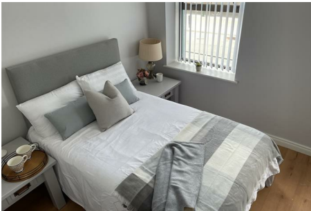
Kitchen / Living / Dining

A deposit and the first month's rent are payable in advance. The property is furnished.