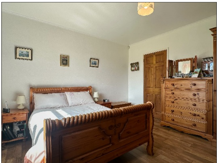
Bedroom 1: 13' 8" X 12' 0" (4.17m X 3.67m) with wooden effect flooring.