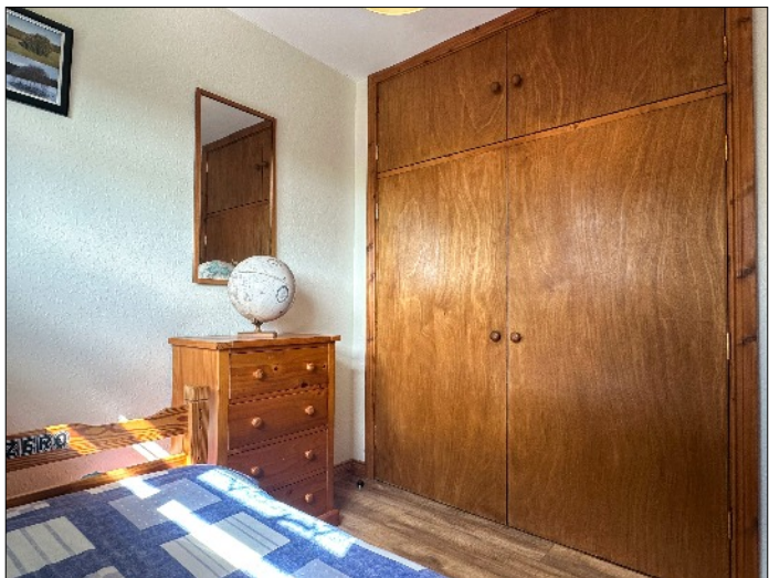
Bedroom 4: 8' 0" X 7' 7" (2.44m X 2.31m) with wooden effect flooring, built in double wardrobe.