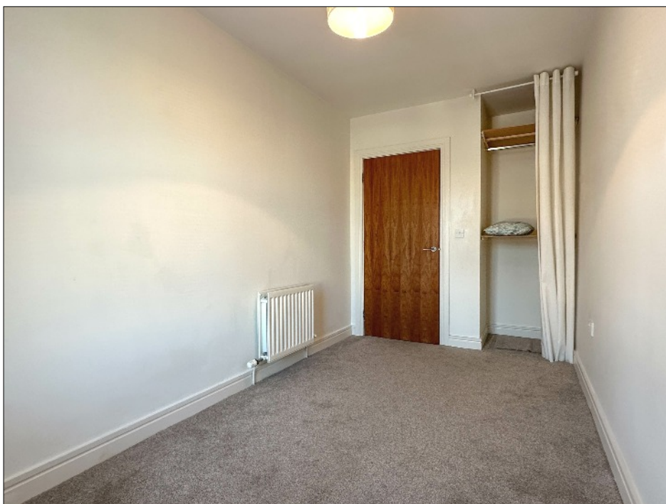
Bedroom 2: 13' 8" X 7' 2" (4.17m X 2.18m) With recess suitable for wardrobe.