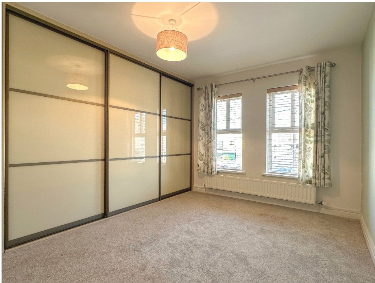
Bedroom 1: 13' 4" X 11' 10" (4.06m X 3.61m) With built in sliderobes, telephone point.

Apt 15 Ardbana Terrace, Mountsandel Road, Coleraine, BT52 1GY