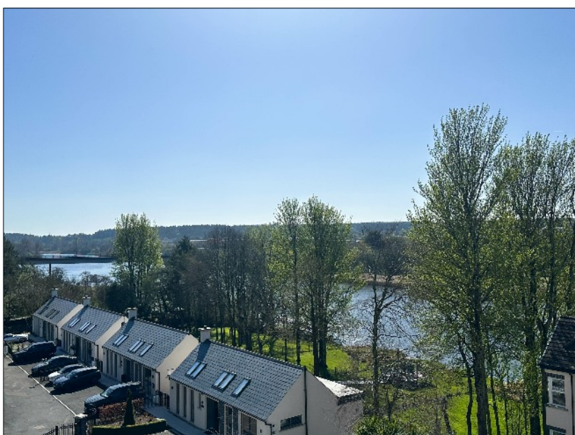
Balcony: With outside light, stunning River Bann views.