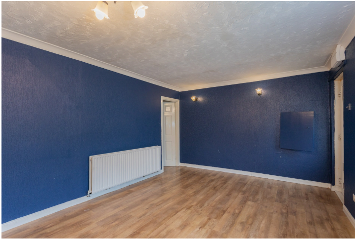
BEDROOM 2: 3.52m x 3.14m