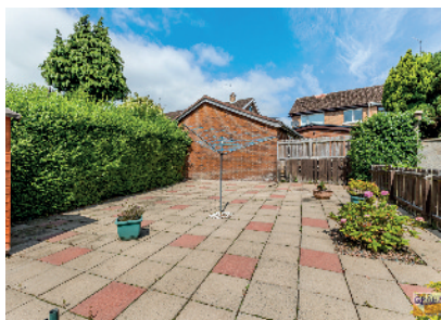
Illustration for identification purposes only, measurements are approximate, not to scale. Fourlabs.co © (ID1219501)