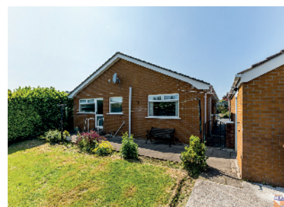
15 Derryvolgie Park