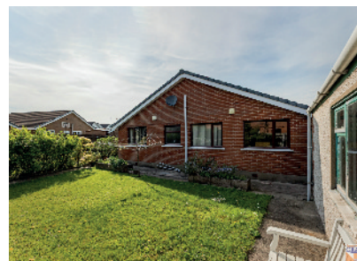
39 Monaville Avenue