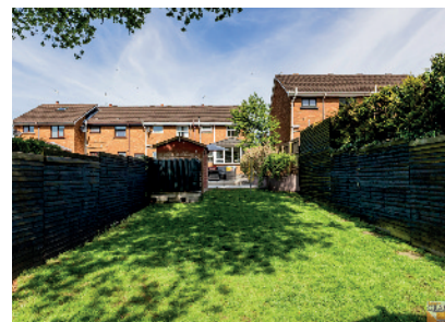
50 Hilden Court