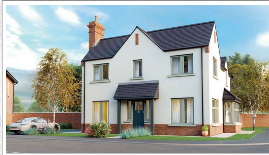
ABOVE: COMPUTER VISUAL OF SITE 10