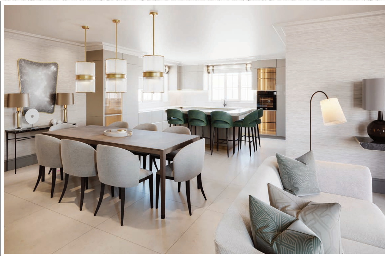
ABOVE: COMPUTER VISUAL FROM THE GATELODGE SHOWING LIVING / DINING / KITCHEN AREA OPPOSITE: COMPUTER VISUAL FROM THE GATELODGE SHOWING LOUNGE