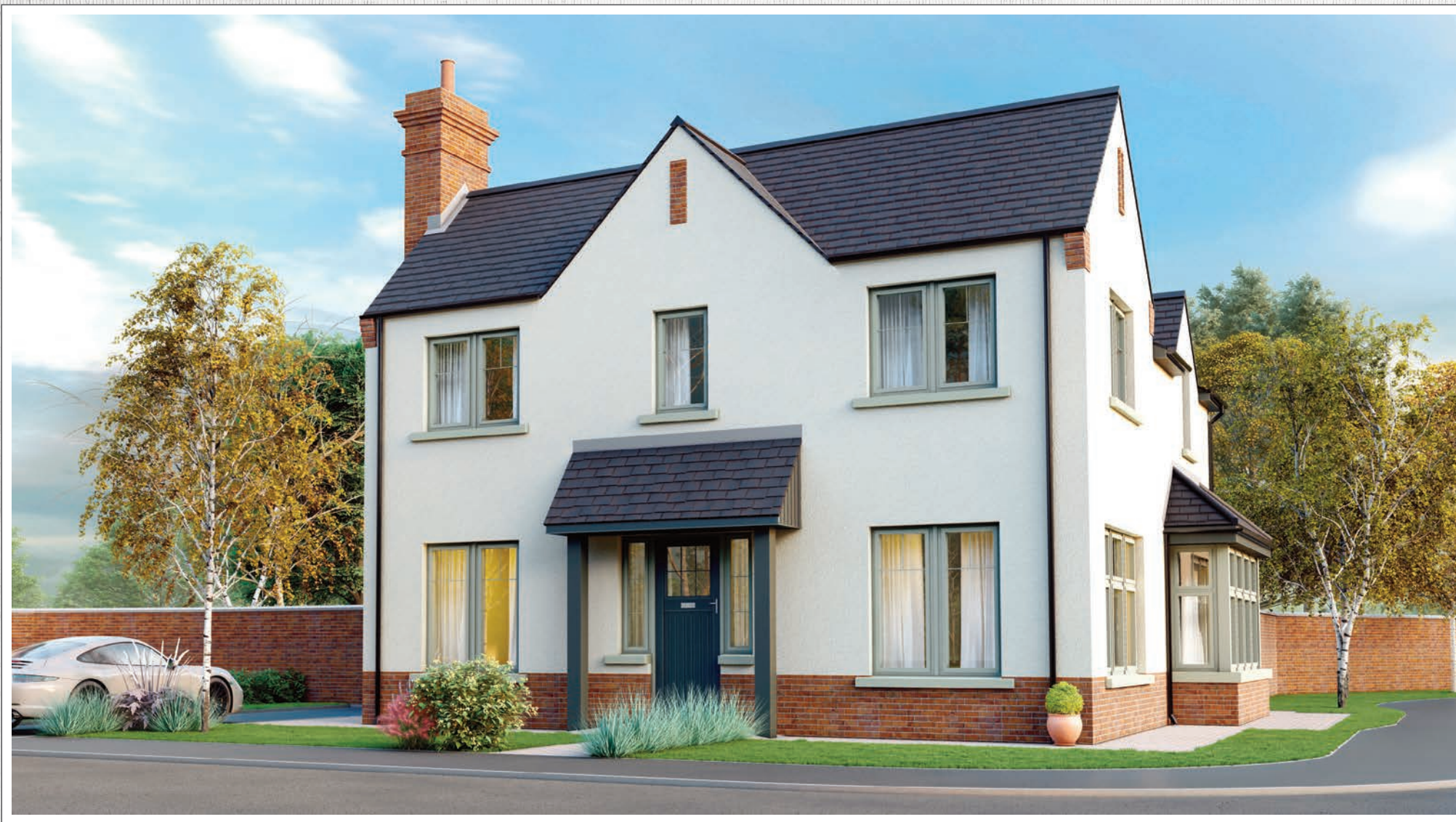
ABOVE: COMPUTER VISUAL SHOWING SITE 10