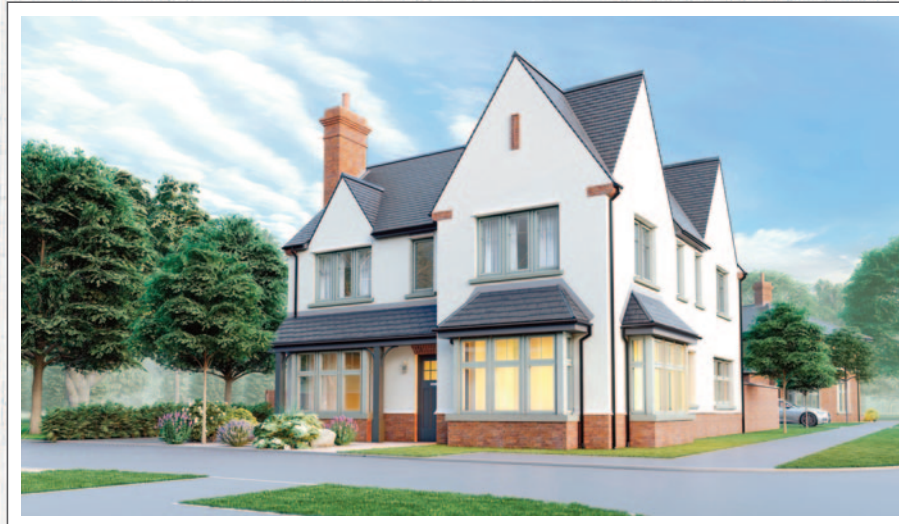
ABOVE: COMPUTER VISUAL OF SITE 4C