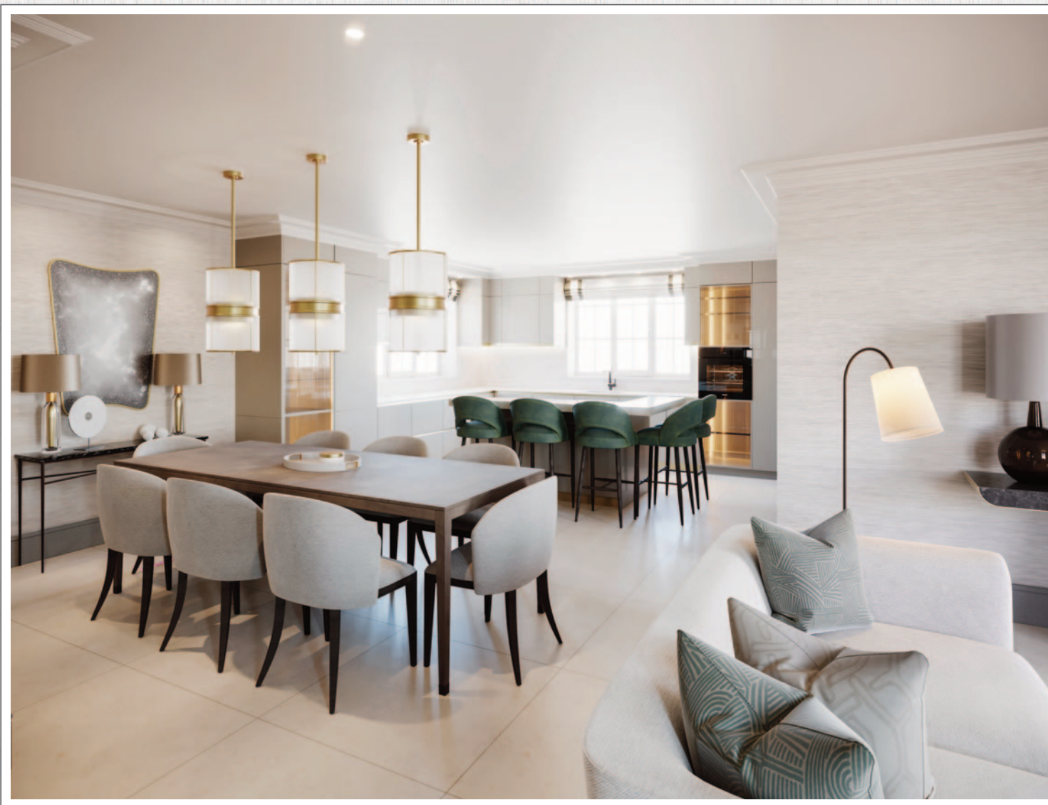
ABOVE: COMPUTER VISUAL FROM THE GATELODGE SHOWING LIVING / DINING / KITCHEN AREA OPPOSITE: COMPUTER VISUAL FROM THE MULBERRY SHOWING LOUNGE