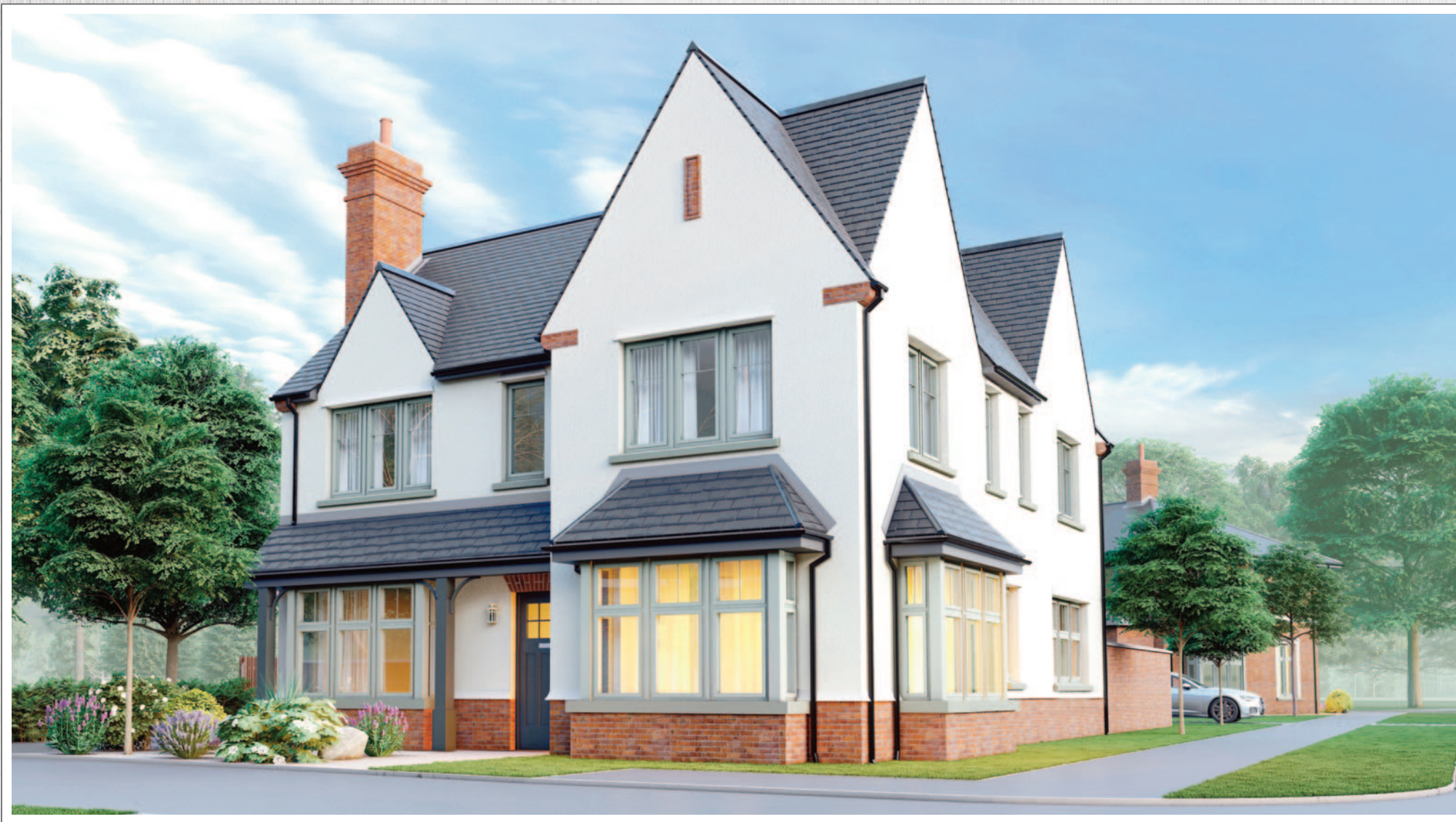
ABOVE: COMPUTER VISUAL OF SITE 4C