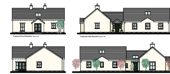
HOUSE TYPE A