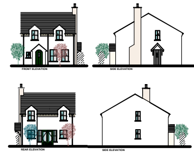
HOUSE TYPE C