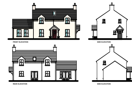
HOUSE TYPE B