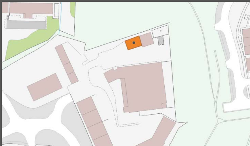
Not To Scale. For indicative purposes only.

The surrounding occupiers include Bassetts, CCT Bathrooms, The Gill Corporation, DAZN and Navico Group.