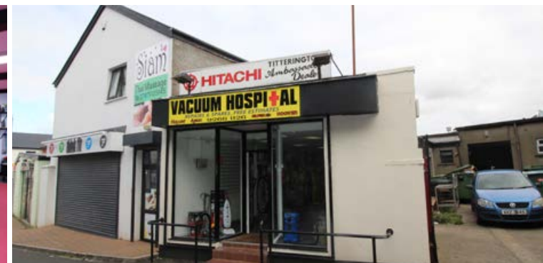
1 Bow Lane