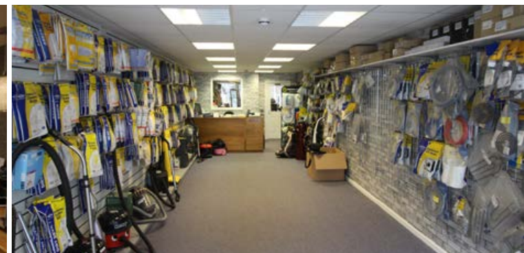
Interior of 1 Bow Lane