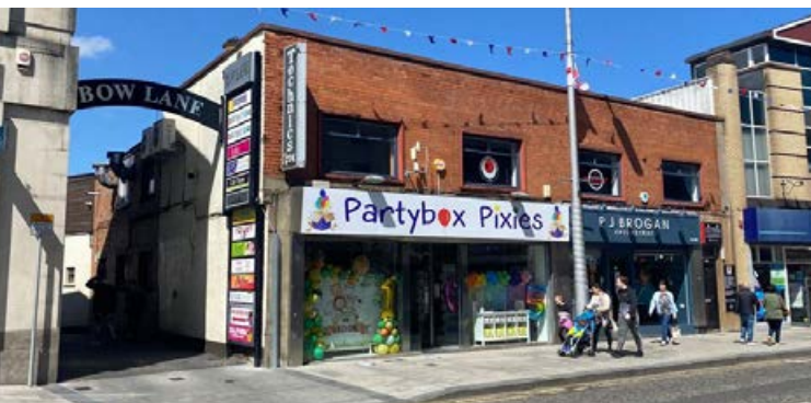
Front of 58 - 60 Bow Street