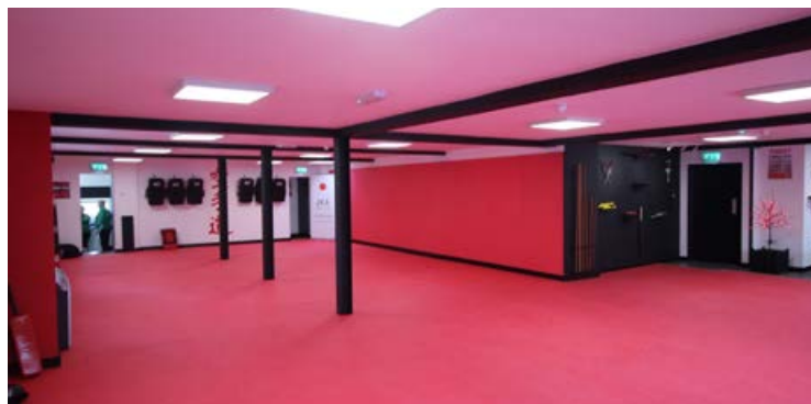
First Floor, 58 - 60 Bow Street