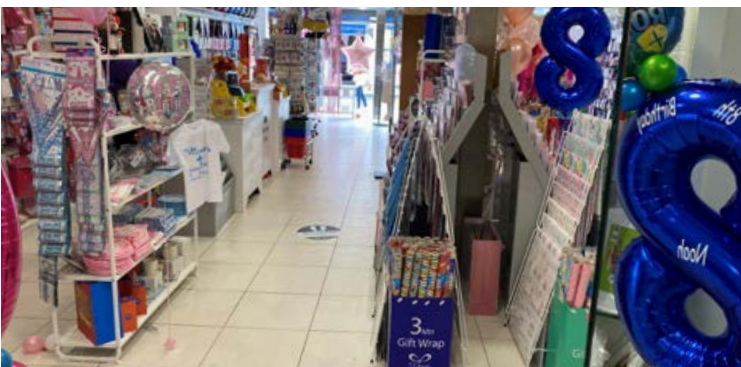
60 Bow Street