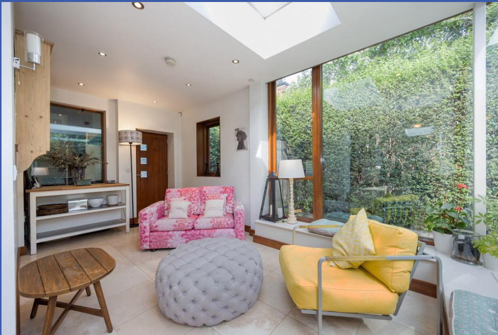
BEDROOM 12' 9" x 11' 0" (3.9m x 3.37m) Cornice ceiling, picture rail.