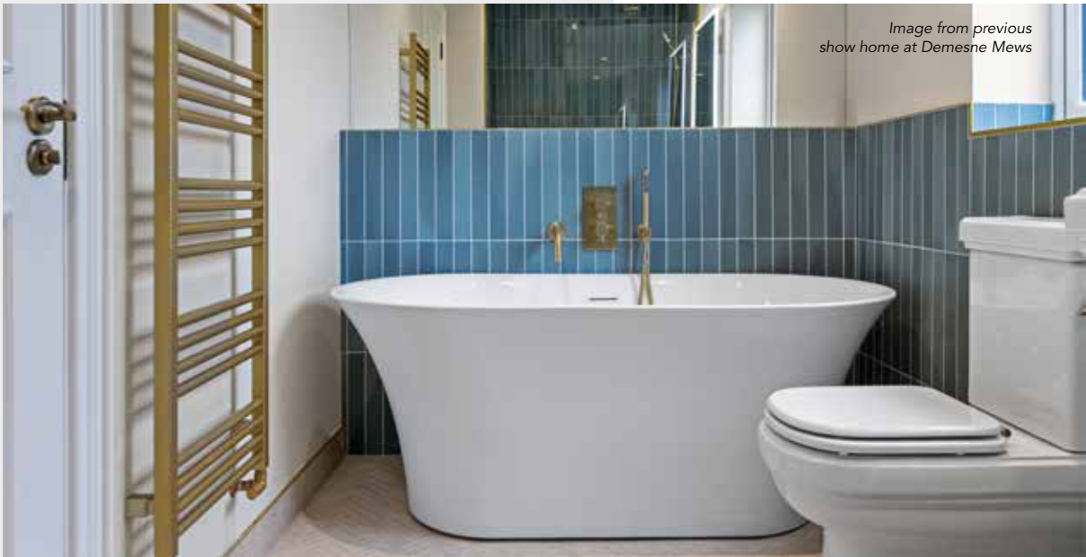
Image from previous show home at Demesne Mews