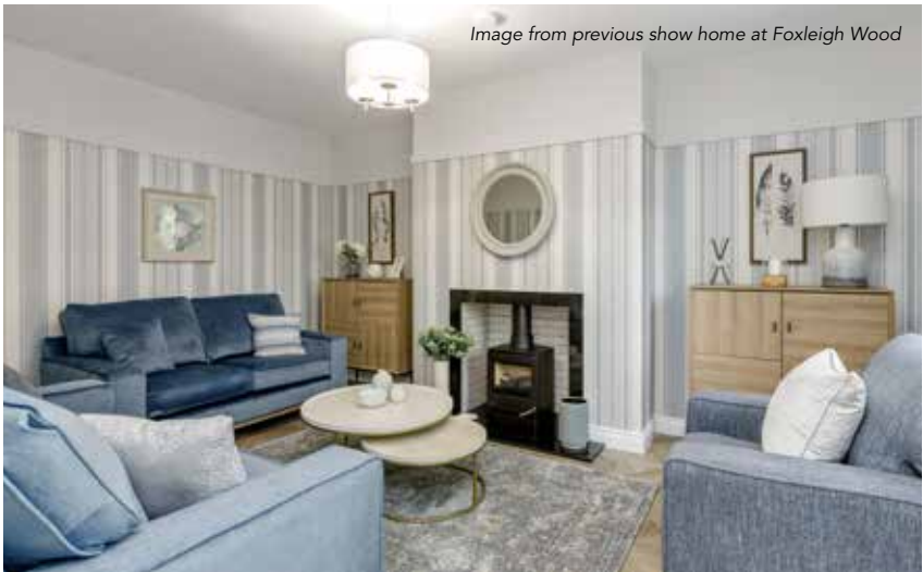
Image from previous show home at Foxleigh Wood