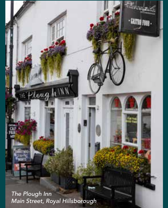
The Plough Inn Main Street, Royal Hillsborough

Embrace a life of luxury in one of Northern Ireland's most sought-after areas.