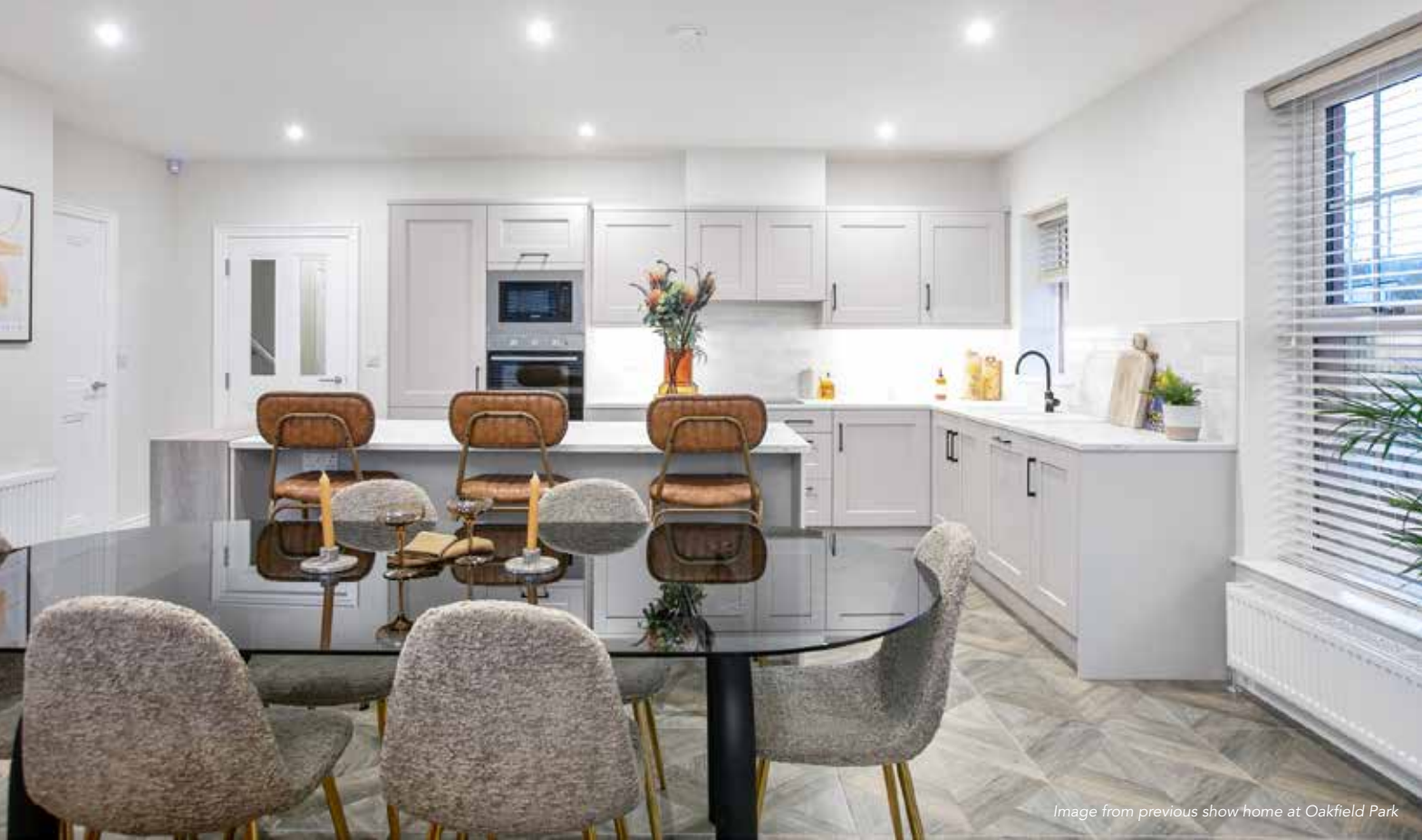
Image from previous show home at Oakfield Park