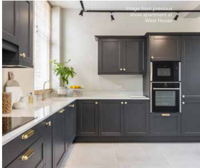
Image from previous show apartment at West House