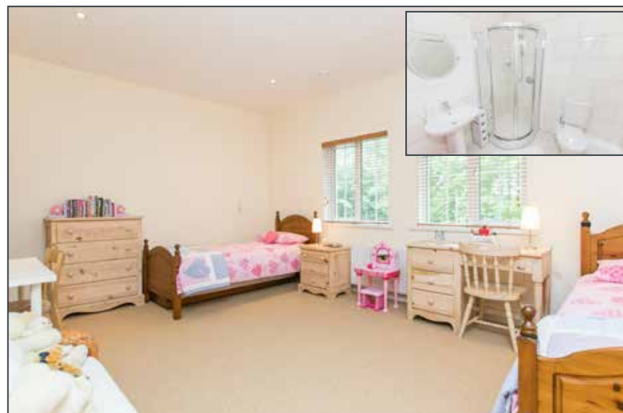
BEDROOM (2): 17' 11" x 14' 1" (5.46m x 4.29m) At widest points.