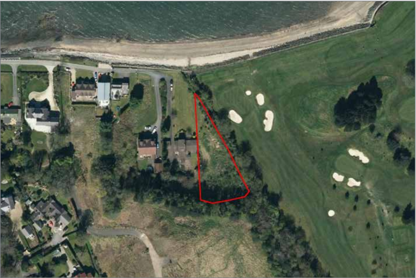
VIEW FROM LOT 3 – SITE @ 117A STATION ROAD, CRAIGAVAD