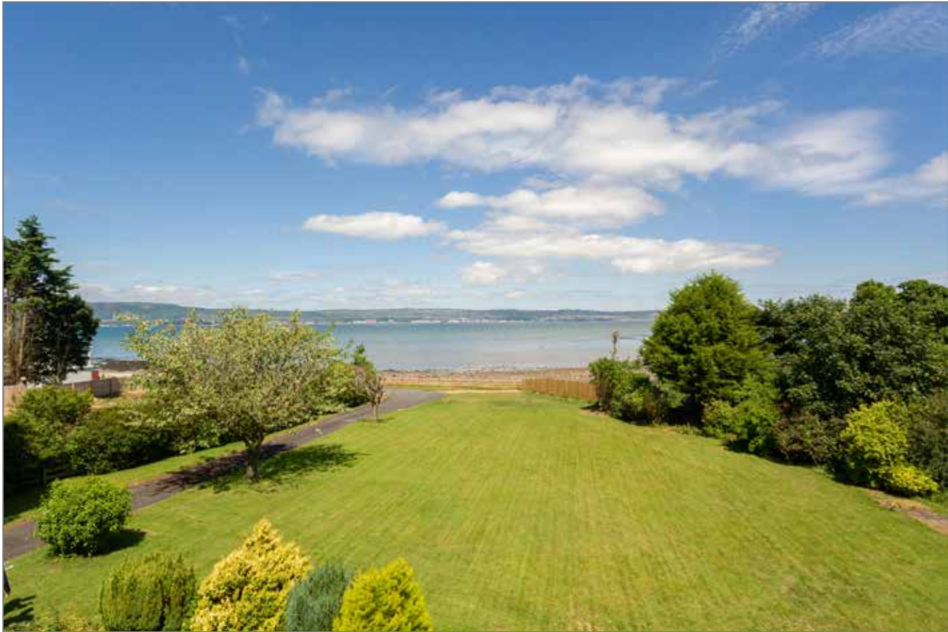
VIEW FROM LOT 2 – SITE @ 117 STATION ROAD, CRAIGAVAD