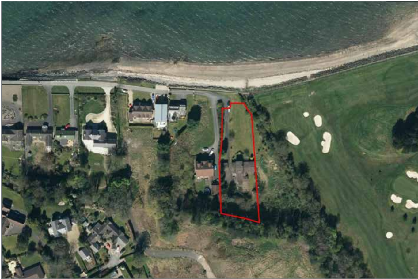
VIEW FROM LOT 2 – SITE @ 117 STATION ROAD, CRAIGAVAD