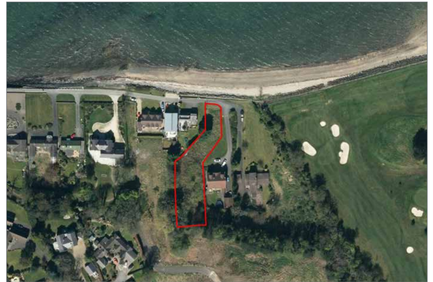
VIEW FROM LOT 1 – SITE @ 115A STATION ROAD, CRAIGAVAD