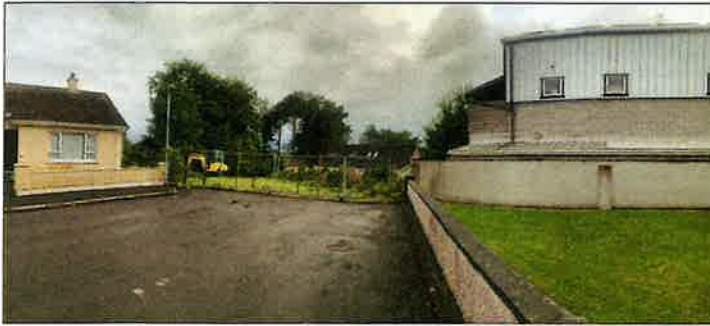
View Into the Site