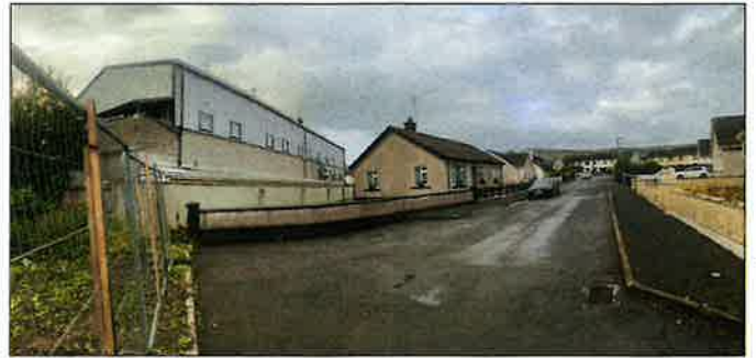
View from the Site