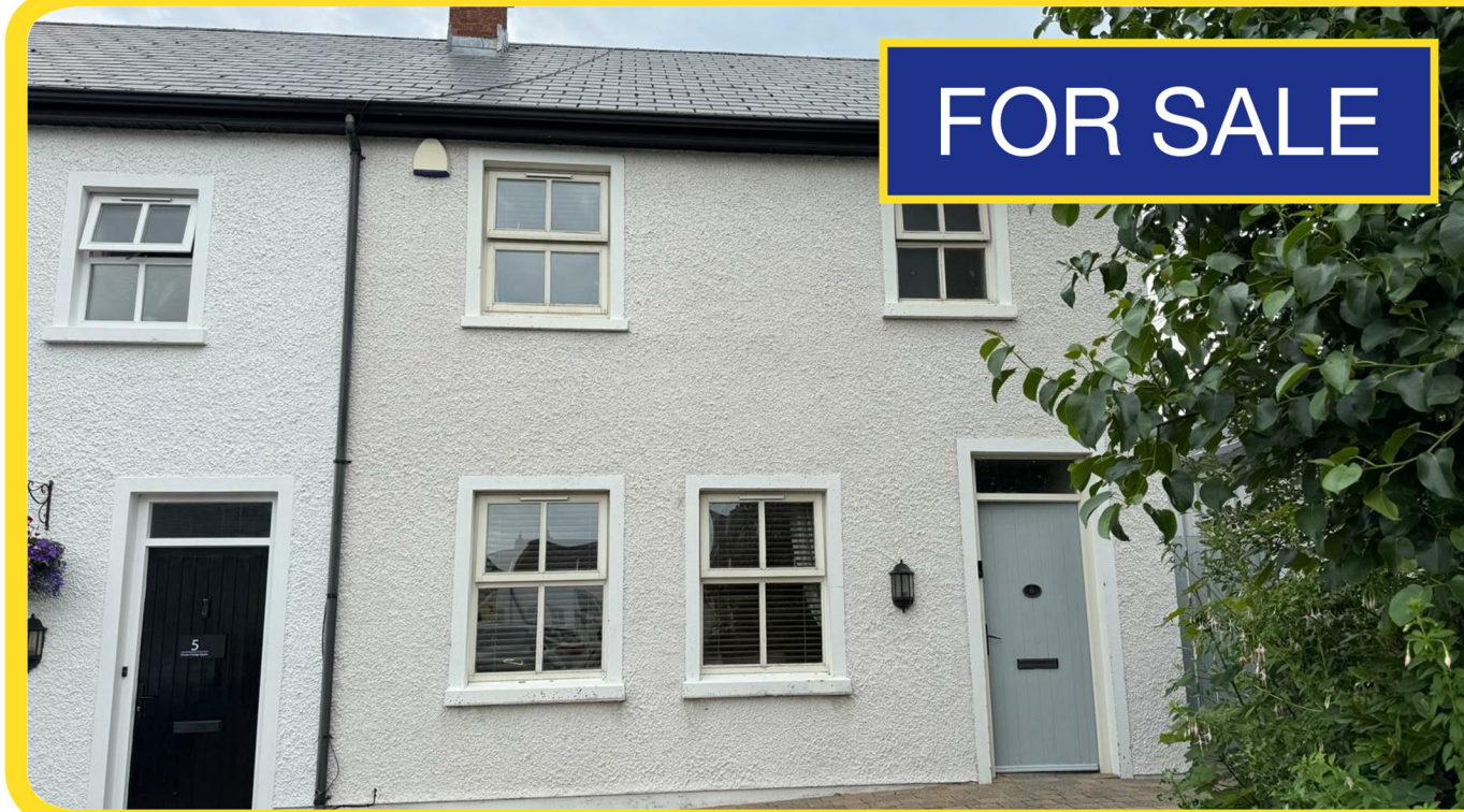
6 Fincairn Cottage Square, Drumahoe, BT47 3FJ