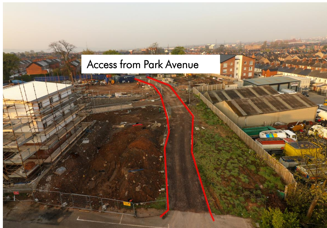
Access from Park Avenue

The subject lands are located on Park Avenue in East Belfast, close to the junction with Hollywood Road and Belmont Road. The Park Avenue Hotel is located a short distance away. This location is a popular residential area with Belfast City Centre within a 10 minute drive time.