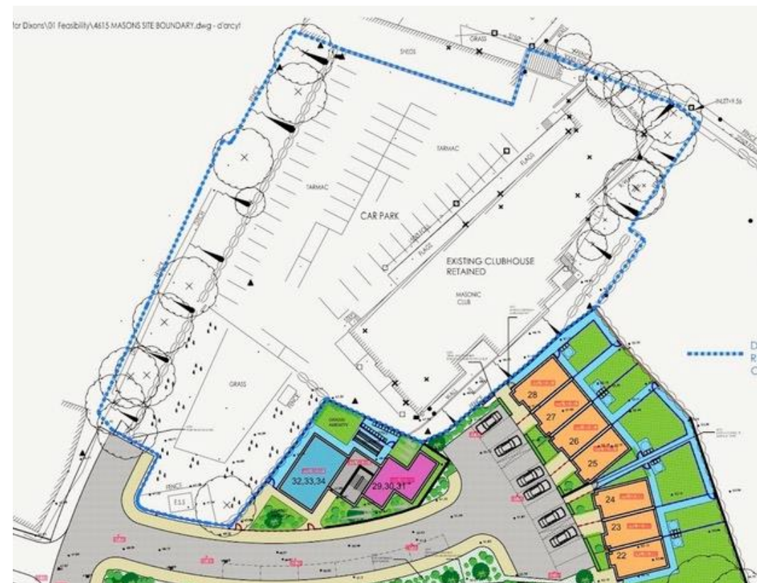
Plan showing access into the site from Park Avenue via new housing development.

All prices quoted are exclusive of VAT, which may be payable.