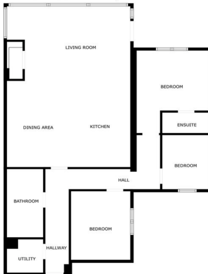
Apartment 11 Castle Linn 2-6 Bath Road, Portrush