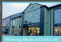
Weaving Sheds & Cloth Loft