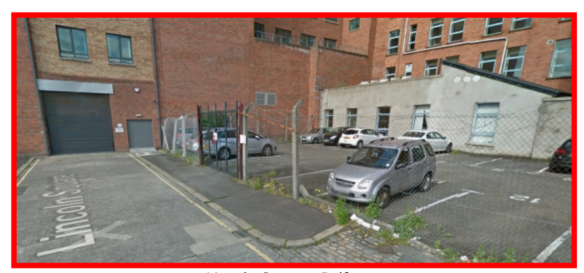
Lincoln Square, Belfast

For further information regarding availability please contact Campbell Cairns:-