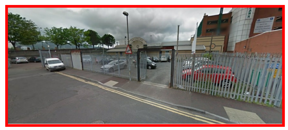
St Andrews Square North, Belfast