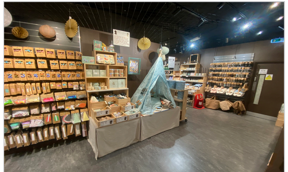
Ground Floor - Sostrene Grene