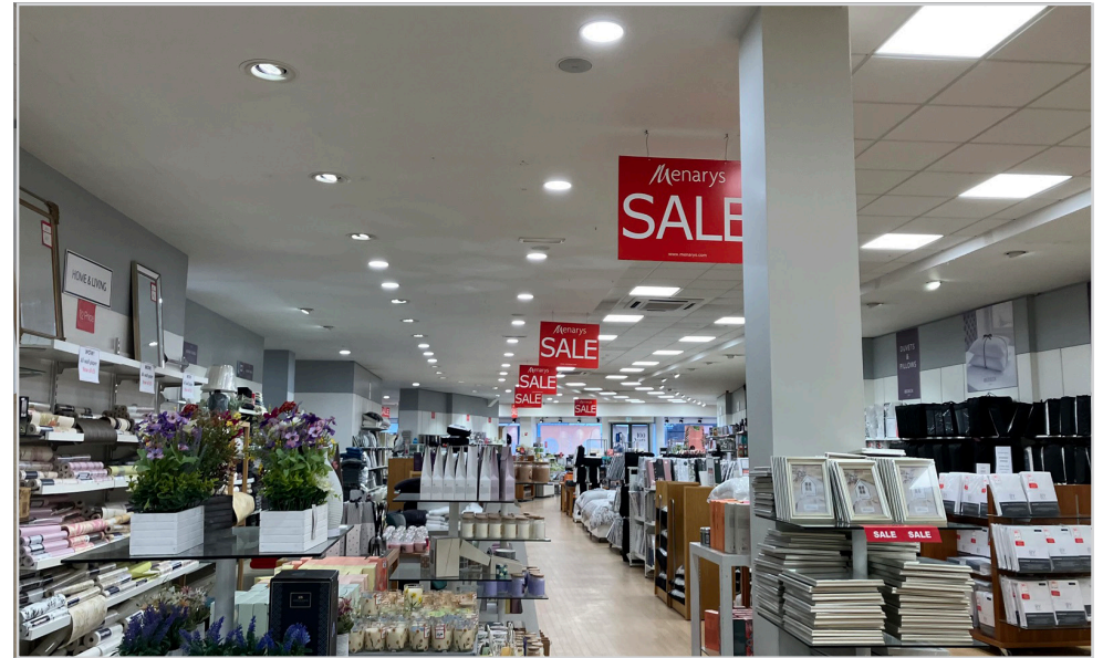
Ground Floor - Menary's