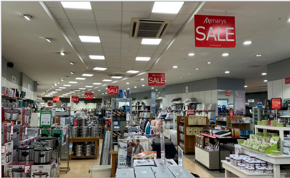
Ground Floor - Menary's