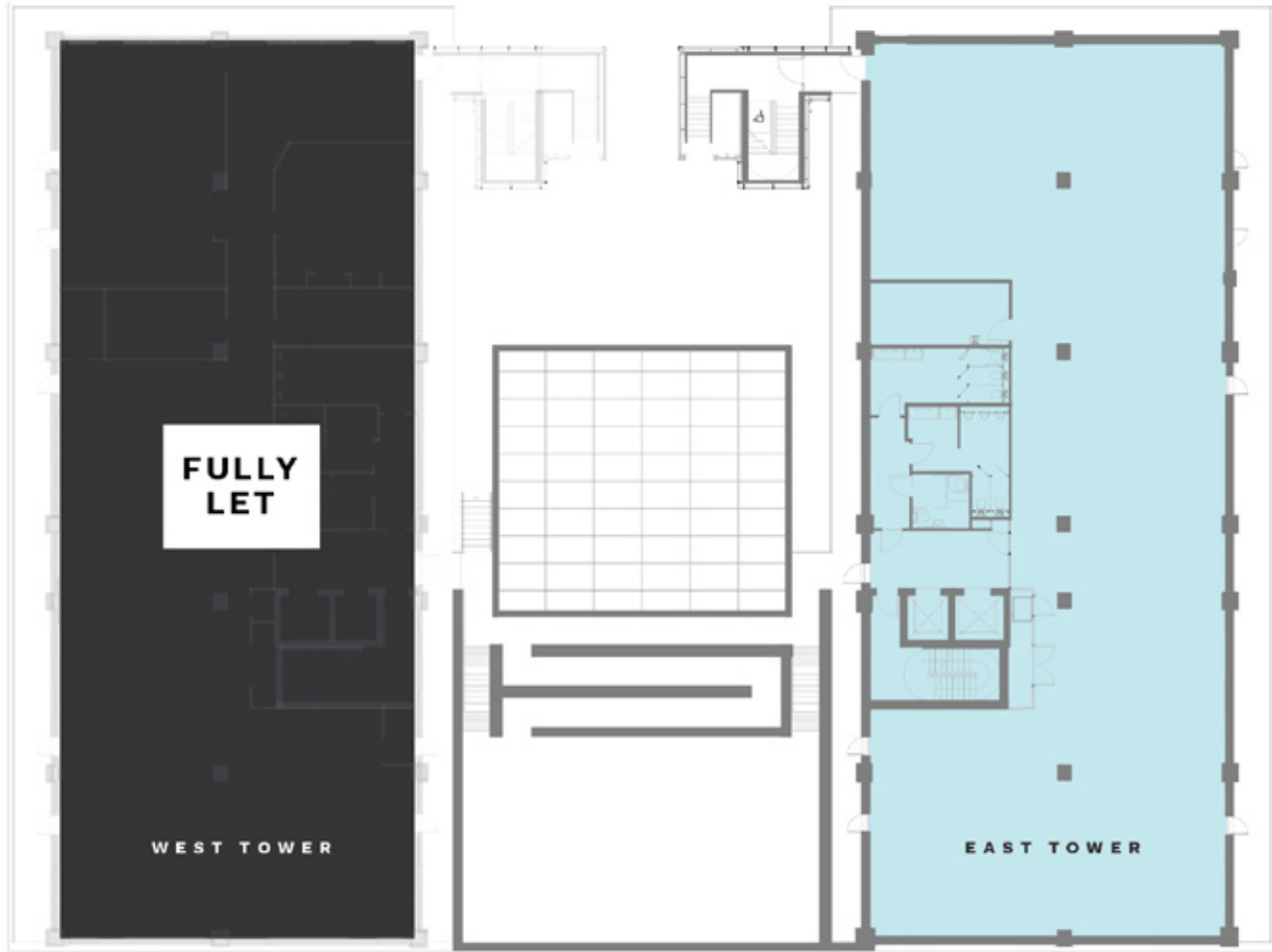
Lanyon Plaza East Tower Floor 5 + Roof Terrace