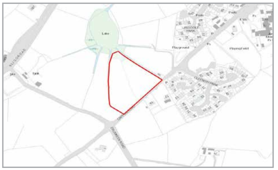
For Indicative Purposes Only