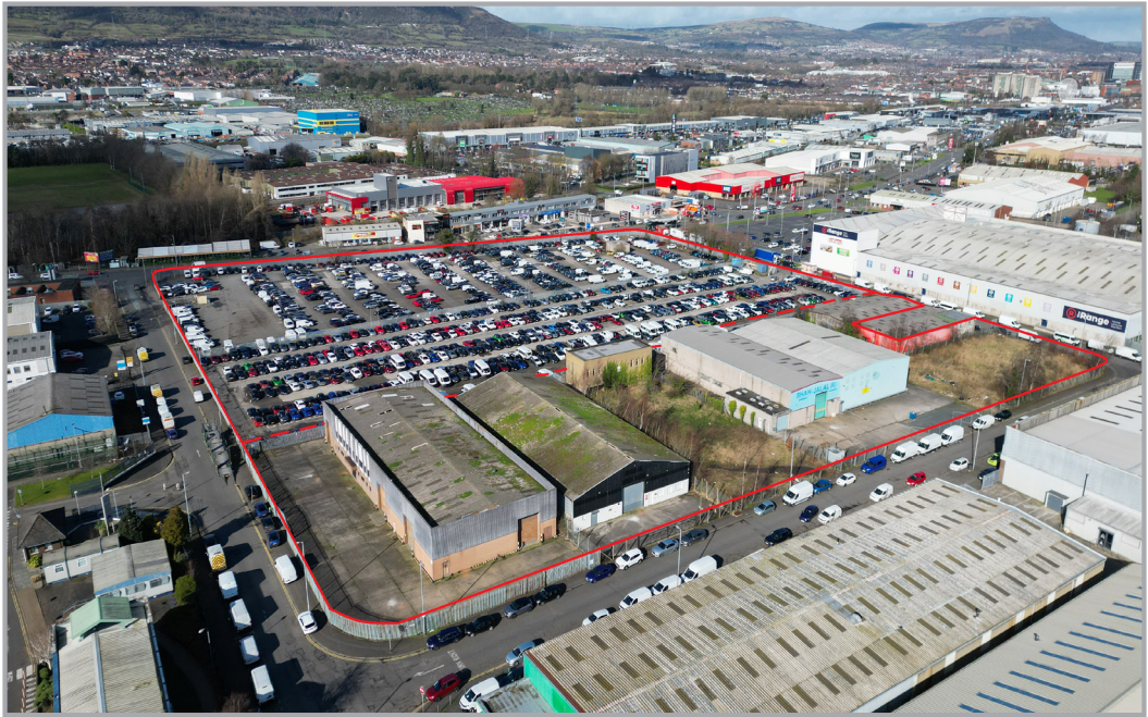
For Indicative Purposes Only