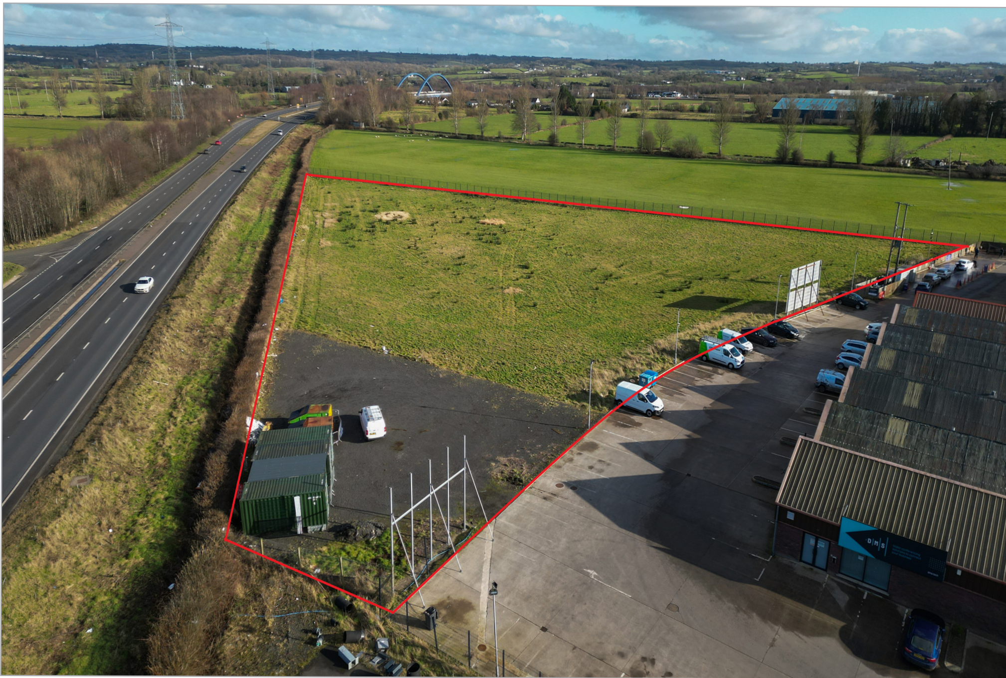
Yard at Shivers Business Park, 21 Hillhead Road, Antrim, BT41 3SF