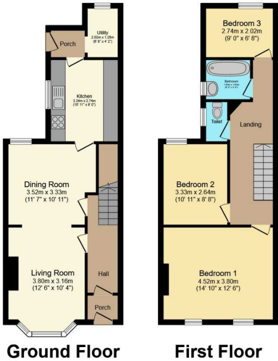
Total floor area 95.8 sq.m. (1,031 sq.ft.) approx

This floor plan is for illustrative purposes only. It is not drawn to scale. Any measurements, floor areas (including any total floor area), openings and orientation are approximate. No details are guaranteed, they cannot be relied upon for any purpose and they do not form part of any agreement. No liability is taken for any error, omission or misstatement. A party must rely upon its own inspection(s). Powered by www.focalagent.com