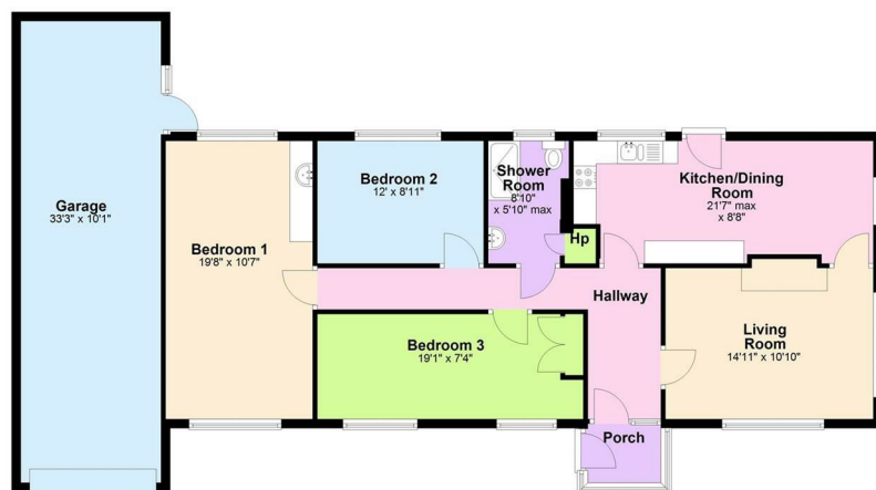
17 Lough Moss Park, Carryduff

Terms & Conditions: Please note that these particulars do not constitute an offer or contract of sale. Any prospective purchaser should satisfy themselves by thorough inspection of the property and we recommend that any prospective purchaser should employ the professional services of a building surveyor and consider their findings prior to entering into contract. All such fees associated with this work will be the responsibility of the prospective purchaser regardless of whether the sale completes or not. In addition, none of the appliances or installations have been tested in any way whatsoever and it is our recommendation that a purchaser should fully satisfy themselves by employing an appropriate expert. We would also like to advise that our measurements are taken from the widest points of each room and should not be relied upon as completely accurate. You should not make decisions based on the measurements provided and double check measurements at all times. Valuation/Mortgage Service: As part of our service we would remind Vendors and potential purchasers that we have a Mortgage Broker available at this branch. If you are thinking of selling, we would be happy to carry out a free market appraisal of your property.