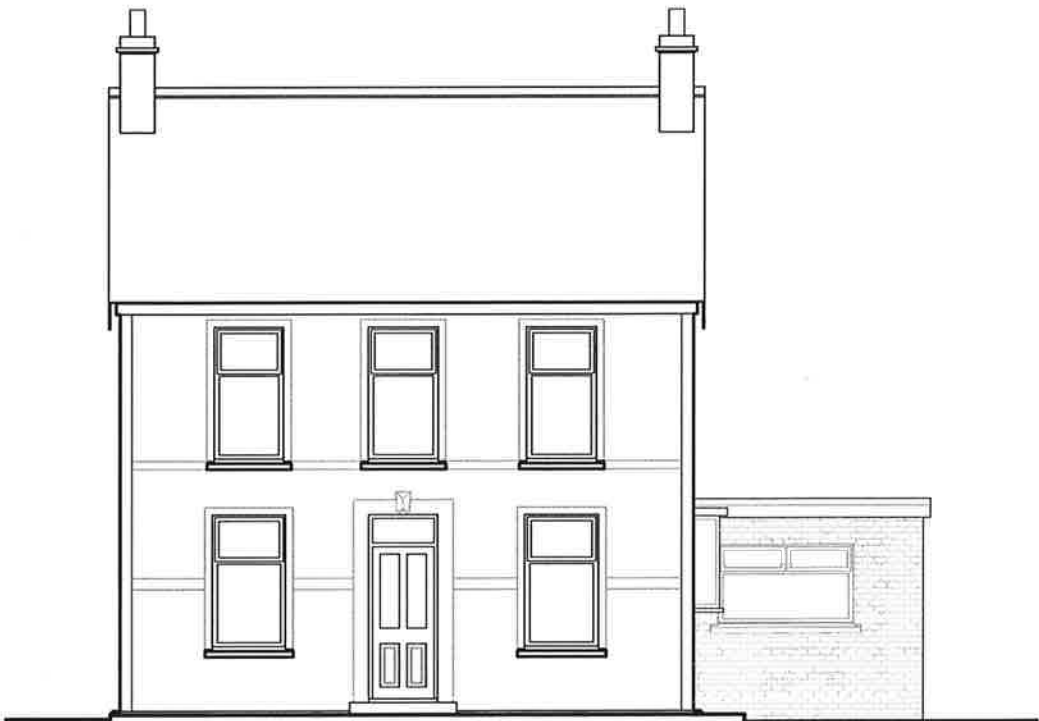
Existing South West Elevation