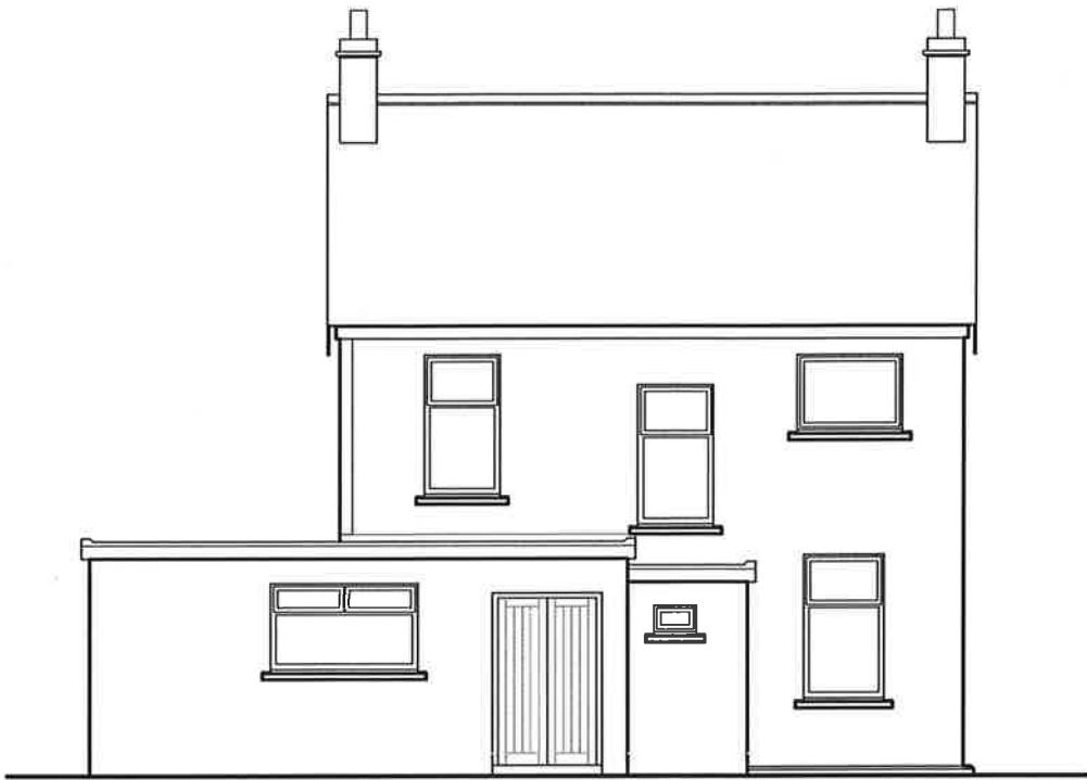
Existing North East Elevation