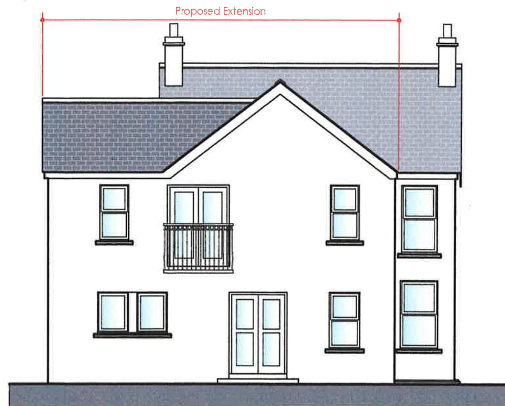
Proposed North East Elevation