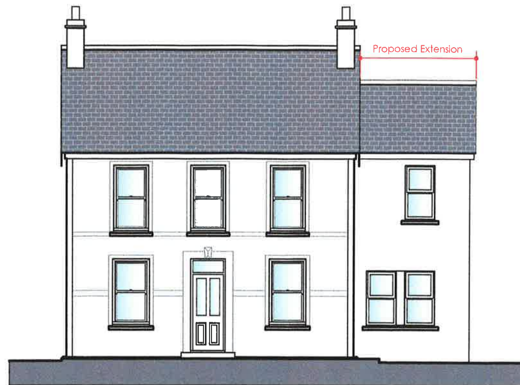
Proposed North East Elevation