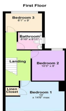
6 Red Row, Drumaness

This well-presented terrace home was originally one of the Mill Workers Homes and on viewing you will be surprised by the spacious accommodation on offer.