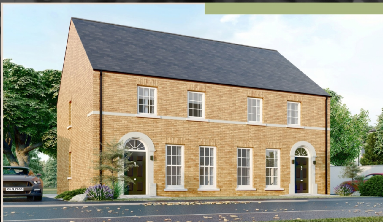
BASHFORD PARK CARRICKFERGUS