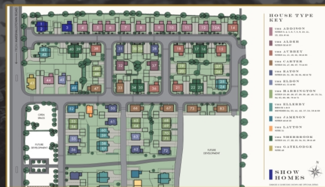
BASHFORD PARK CARRICKFERGUS