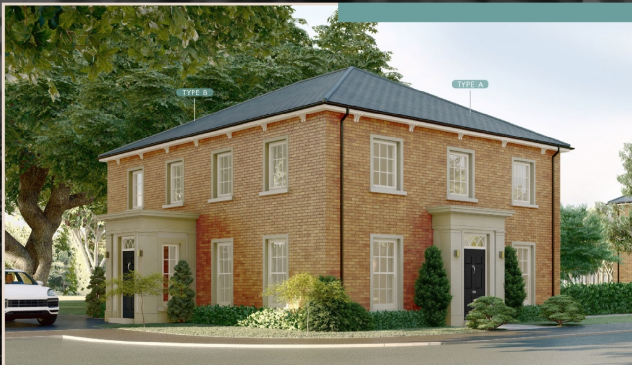
BASHFORD PARK CARRICKFERGUS