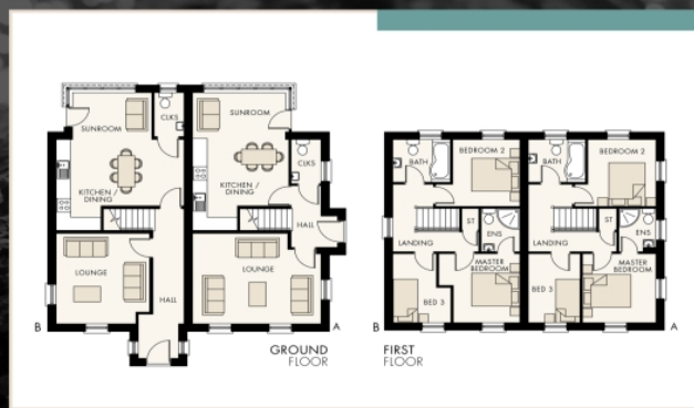
BASHFORD PARK CARRICKFERGUS