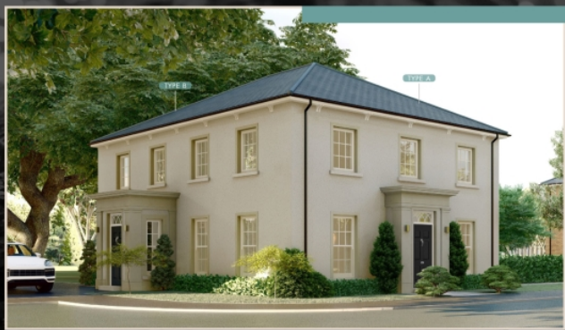
BASHFORD PARK CARRICKFERGUS