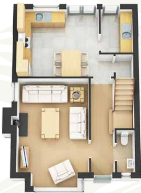
Optional Ground Floor**