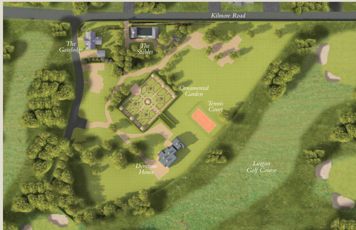
Demesne Country Estate Site Layout