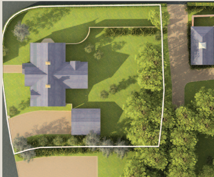
The Gate Lodge Garden Plan