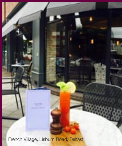
French Village, Lisburn Road, Belfast