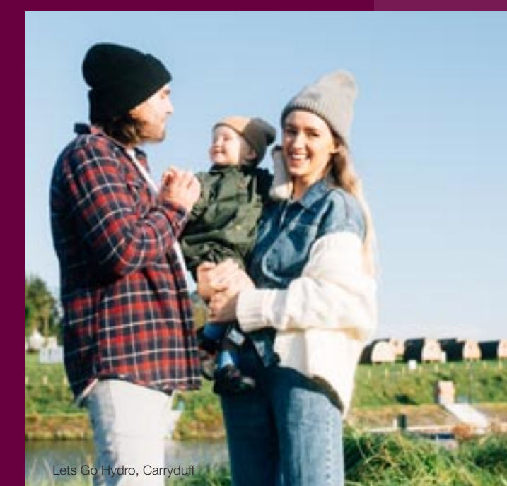
Lets Go Hydro, Carryduff