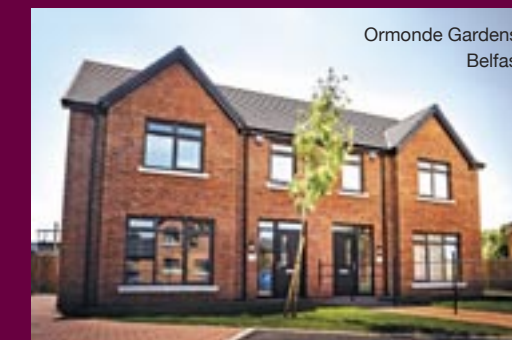
Ormonde Gardens, Belfast