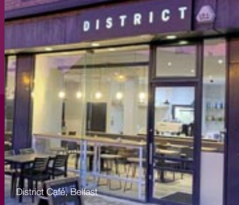
District Café, Belfast