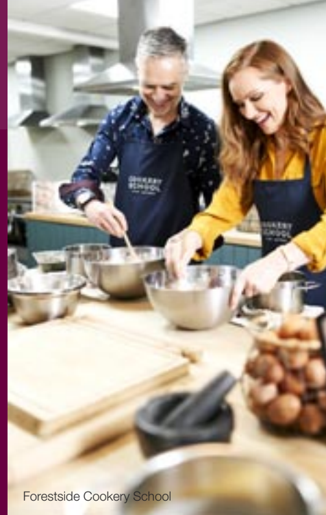
Forestside Cookery School