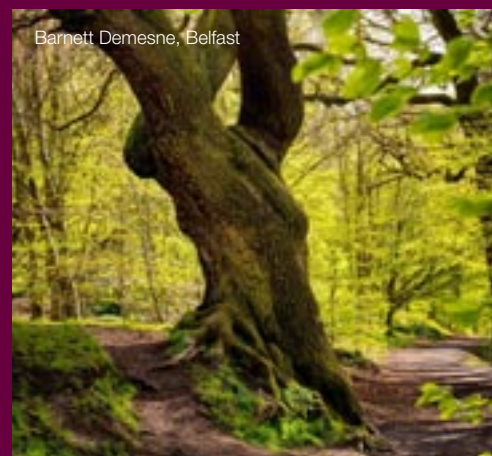
Barnett Demesne, Belfast