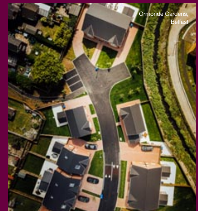
Ormonde Gardens, Belfast

Marlborough Manor, Carrickfergus Ballyhenry Manor, Comber Lios Na Greine, Letterkenny Fortfield Manor, Greenisland Ormonde Gardens, Belfast The Highways, Larne