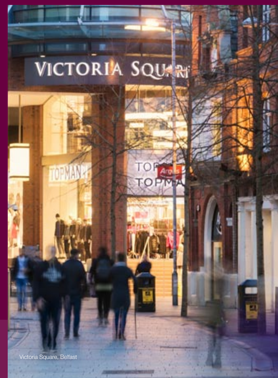
Victoria Square, Belfast