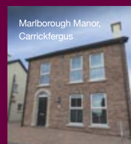
Marlborough Manor, Carrickfergus