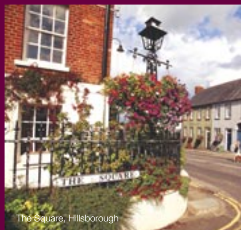
The Square, Hillsborough