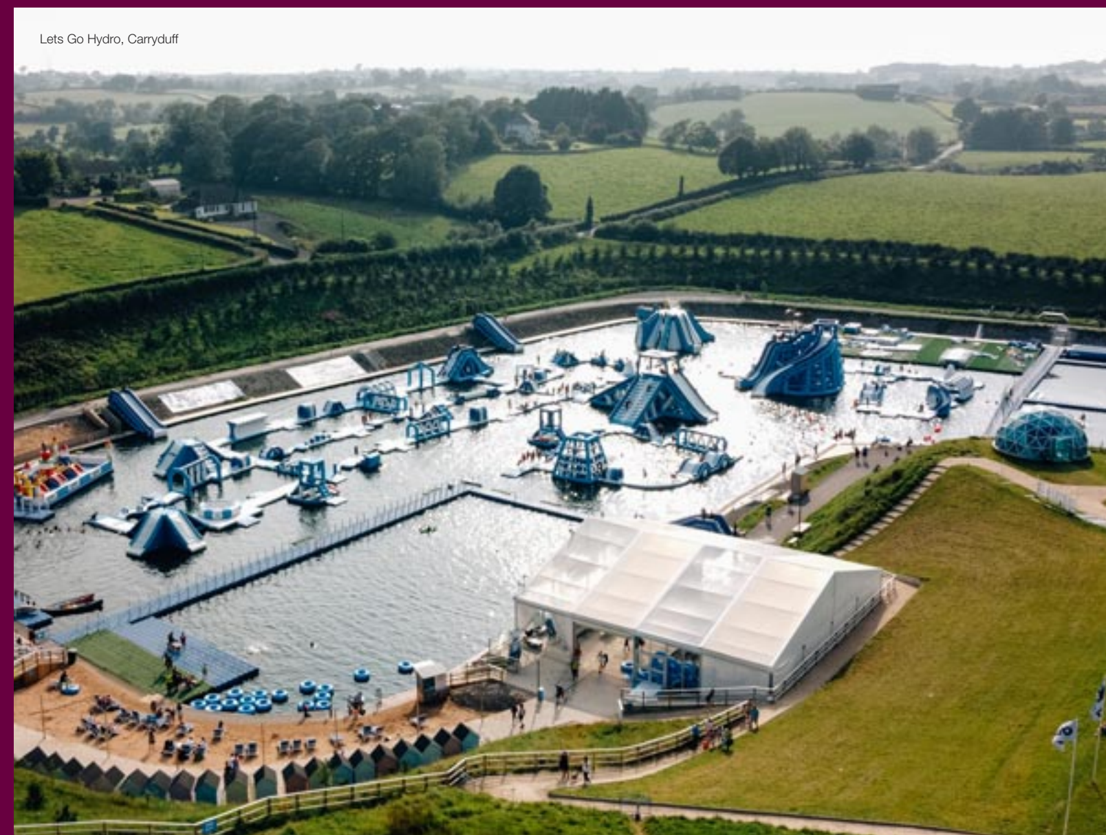
Lets Go Hydro, Carryduff