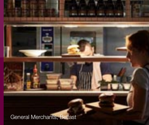
General Merchants, Belfast