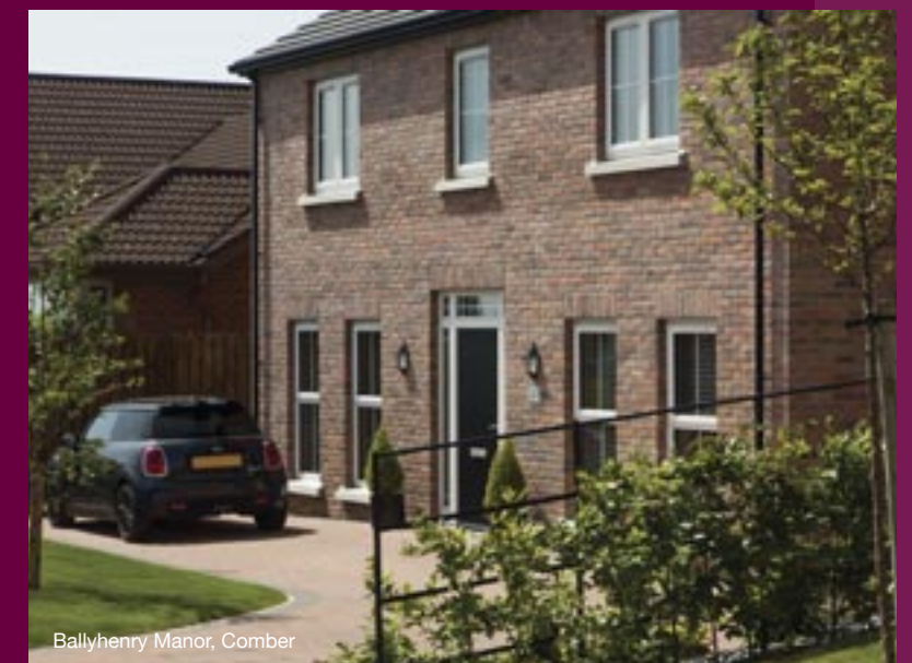
Ballyhenry Manor, Comber

Traditional designs, built to the highest standards, in key locations. We recognise that our customers are at the core of our business and therefore, pride ourselves on providing the highest levels of customer service. You will be proud to call your home a Rosemount Home.