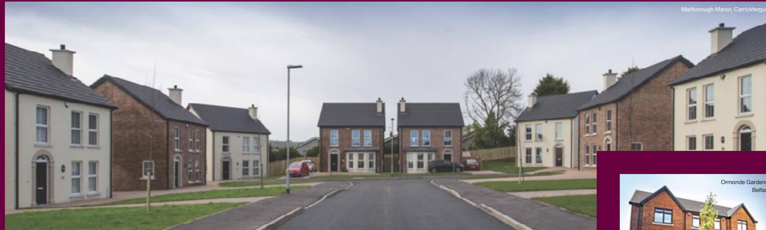
Marlborough Manor, Carrickfergus