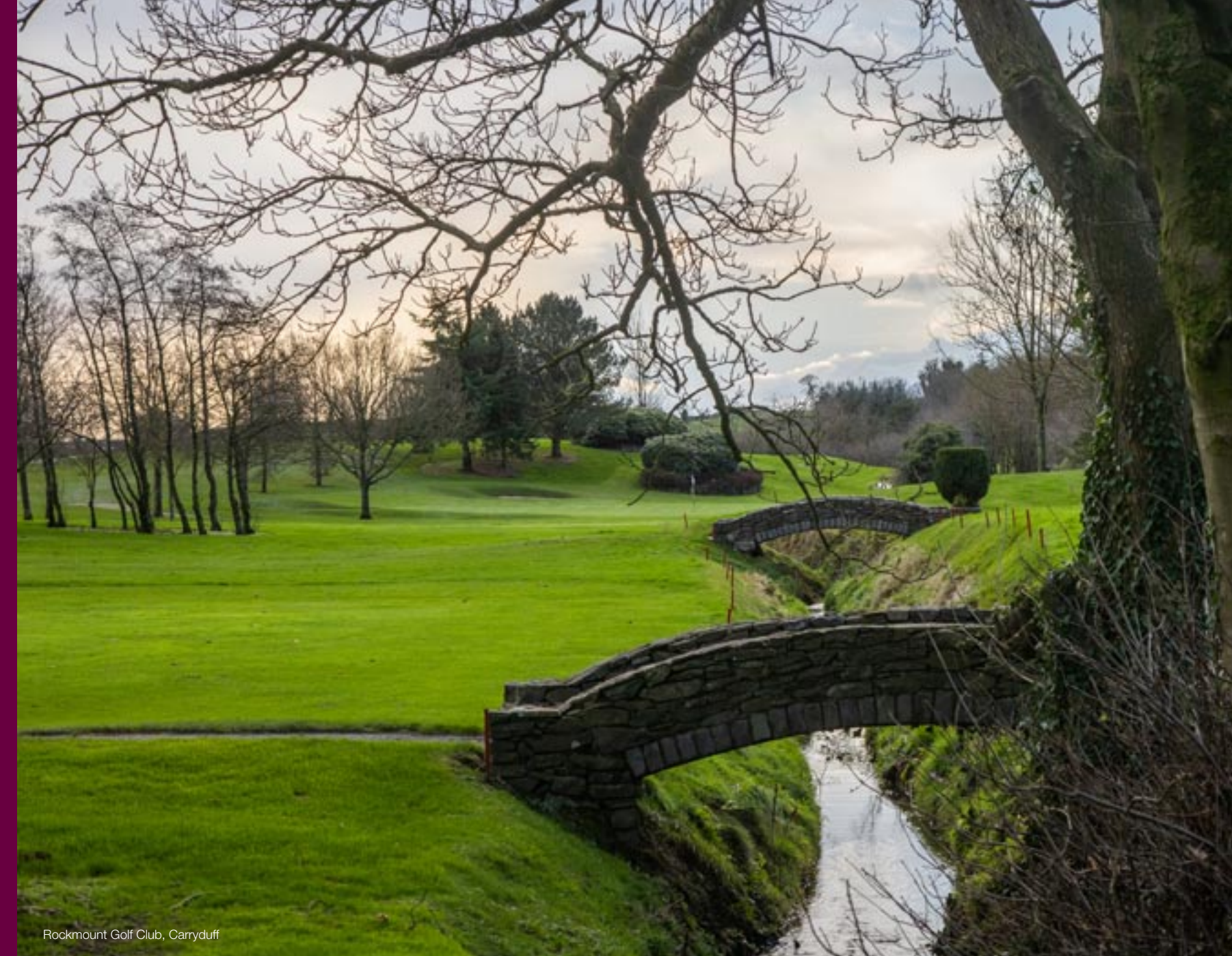
Rockmount Golf Club, Carryduff