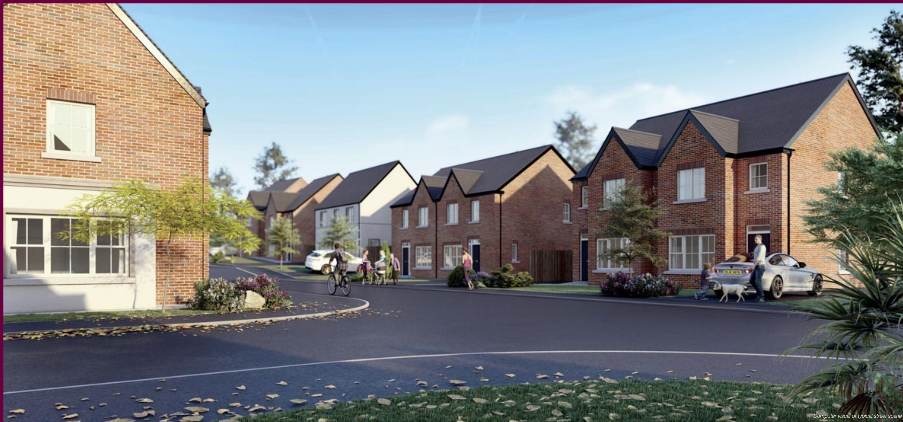
Computer visual of typical street scene

Rosemount Homes follow the ‘Consumer Code for Homebuilders’ and ensure that our customer service is consistently high.