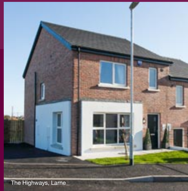
The Highways, Larne