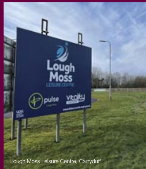
Lough Moss Leisure Centre, Carryduff