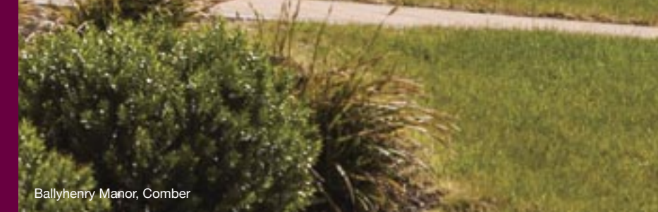
Ballyhenry Manor, Comber