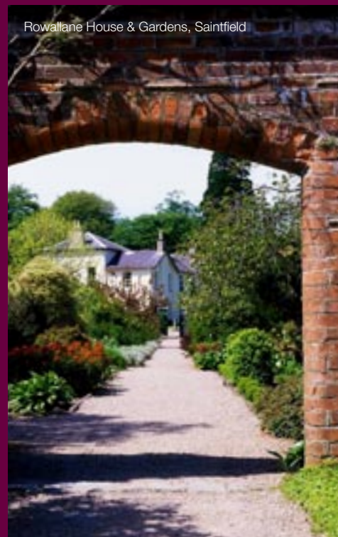
Rowallane House & Gardens, Saintfield