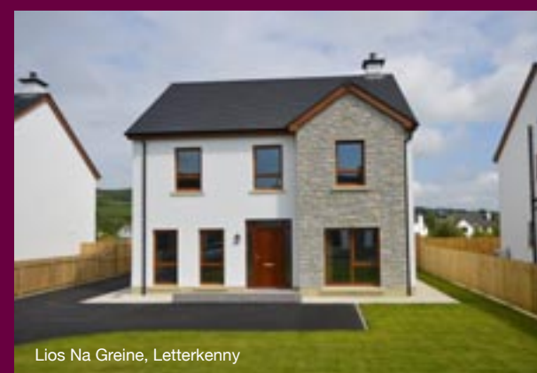
Lios Na Greine, Letterkenny