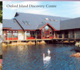
Oxford Island Discovery Centre