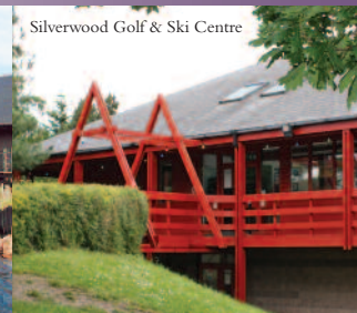
Silverwood Golf & Ski Centre