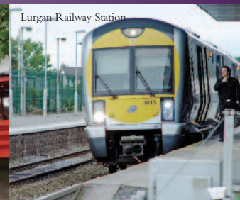
Lurgan Railway Station

This new phase at the extremely popular Belvedere will enhance the reputation as one of the the most innovative developments in Lurgan, helping to form a focal point off Kilmore Road on the outskirts of this historic town.