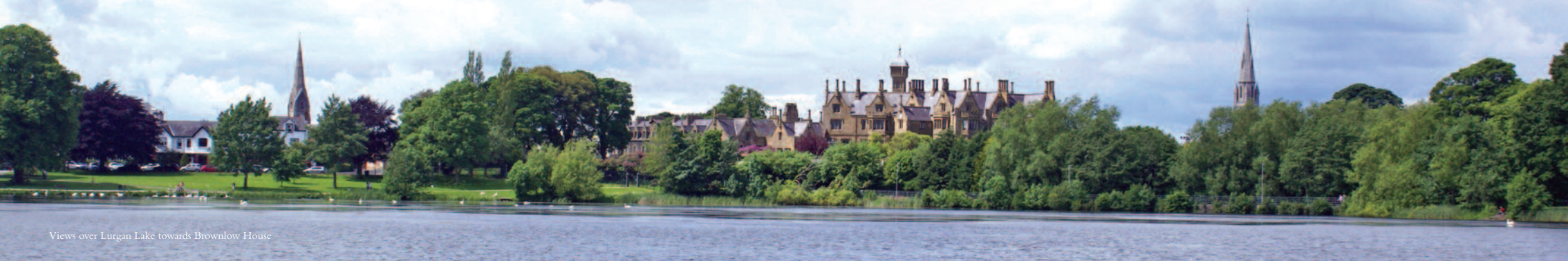
Views over Lurgan Lake towards Brownlow House

The developers and local estate agents have identified the need for well designed, quality accommodation with added kerb appeal. This new chapter in Belvedere will cater for every purchaser's specific needs, with a standard of finish to match the outstanding external elevations. Belvedere's established community environment will be enhanced by this new phase, focusing on safe family living and making it one of the most sought after developments in the town.