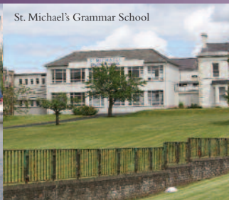
St. Michael's Grammar School