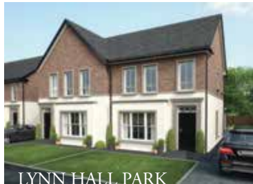
LYNN HALL PARK Bangor