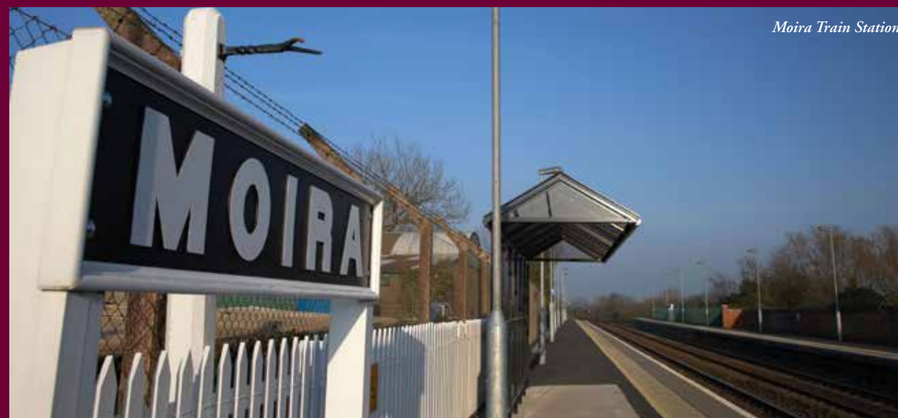
Moira Train Station