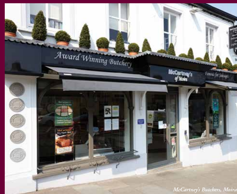
McCartney's Butchers, Moira