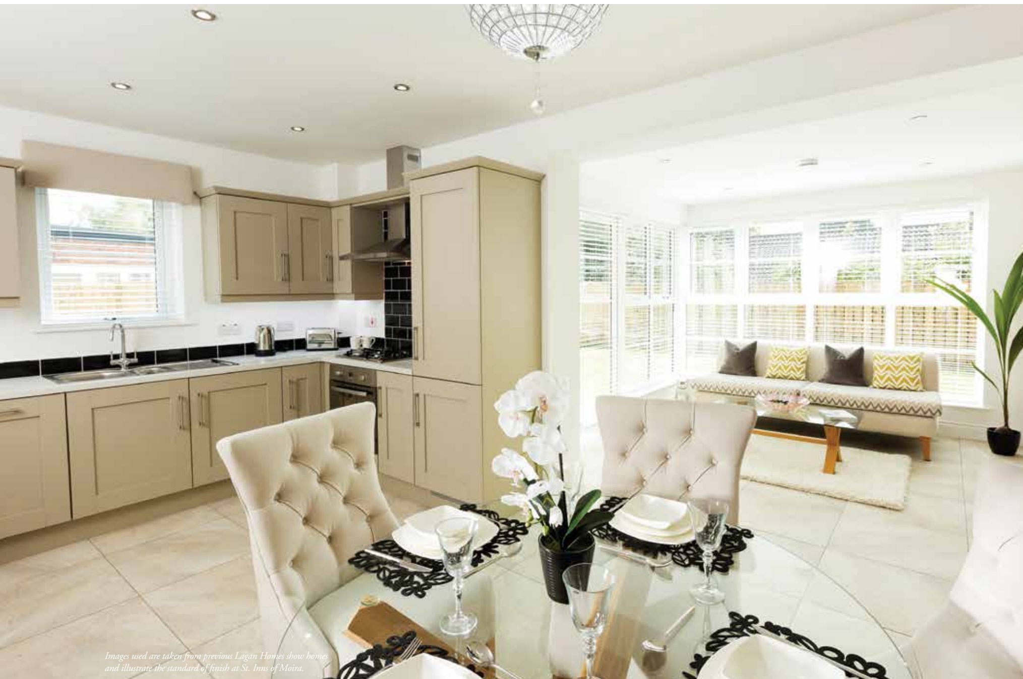
Images used are taken from previous Lagan Homes show homes and illustrate the standard of finish at St. Inns of Moira.