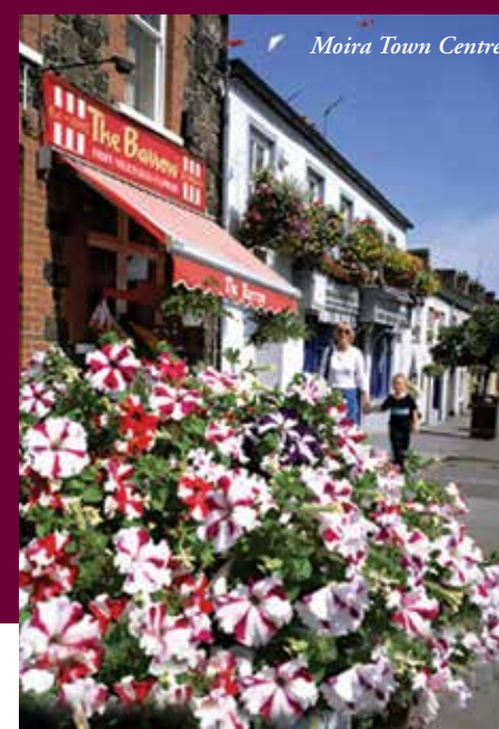
Moira Town Centre