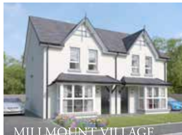
MILL MOUNT VILLAGE Dundonald