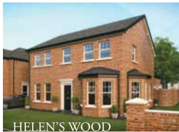
HELEN'S WOOD Bangor