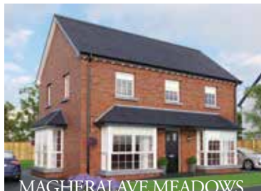
MAGHERA MEADOWS Lisburn